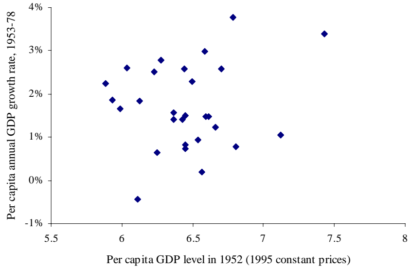
Figure 2. Unconditional \beta -convergence, 1953-78 and 1979-98