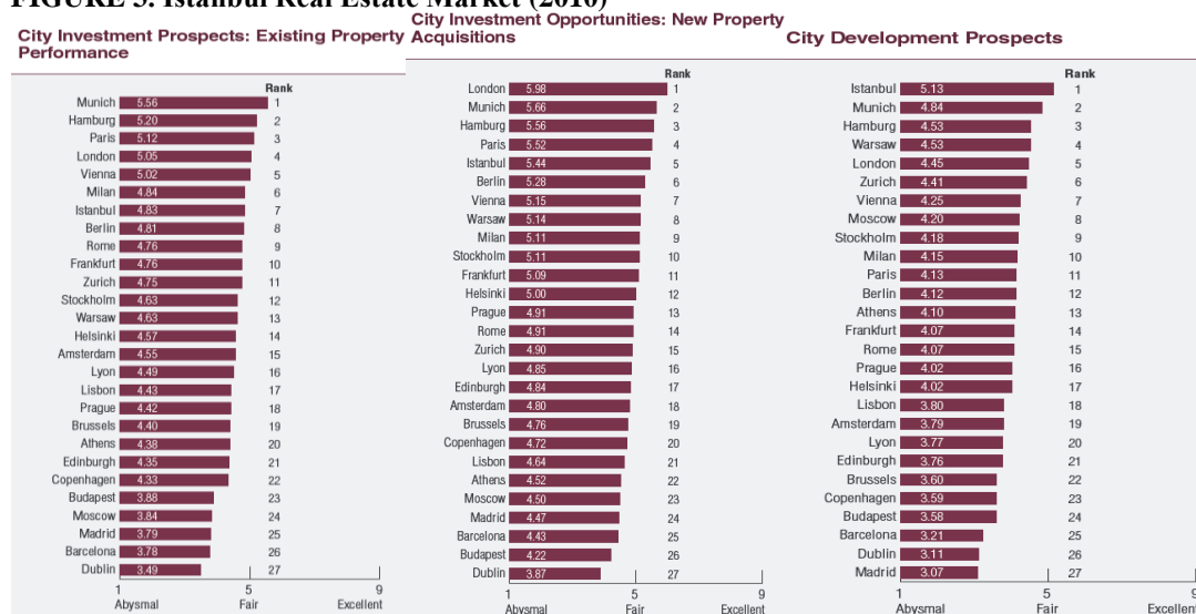
FIGURE 3. İstanbul Real Estate Market (2010)

In the report Emerging Trends in Real Estate Europe 2010, ULI and PwC (2010: 9, 35) ranked İstanbul third for investment prospects and first for development. On the other hand, according to existing property performance and new property opportunities, İstanbul seems to be one of the leading markets.