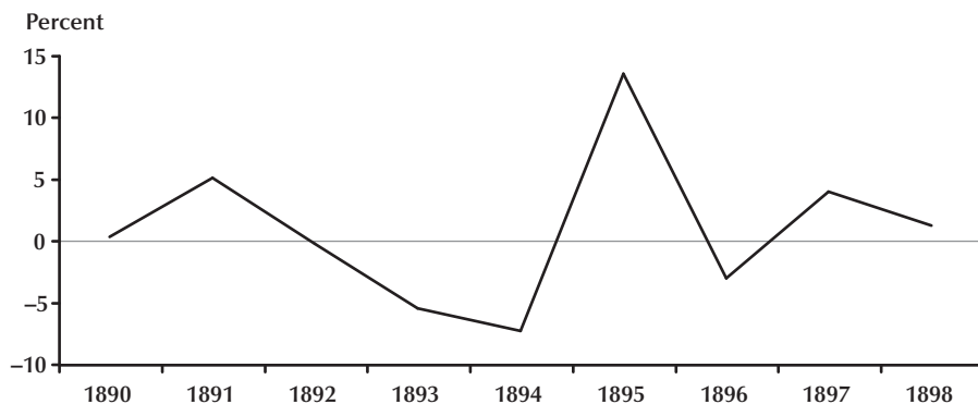
Figure 2 Change in Real per Capita GDP (1890-98)

It is unlikely that the hardships of the 1890s went unnoticed by the federal government, but laws, institutions, and the public’s view on the role of government had to change before any government intervention would occur. President Grover Cleveland clearly stated his view on the limited role of the federal government when he vetoed the Texas Seed Bill in 1887, a bill that would have authorized the federal government to purchase and distribute seed grain to Texas farmers: