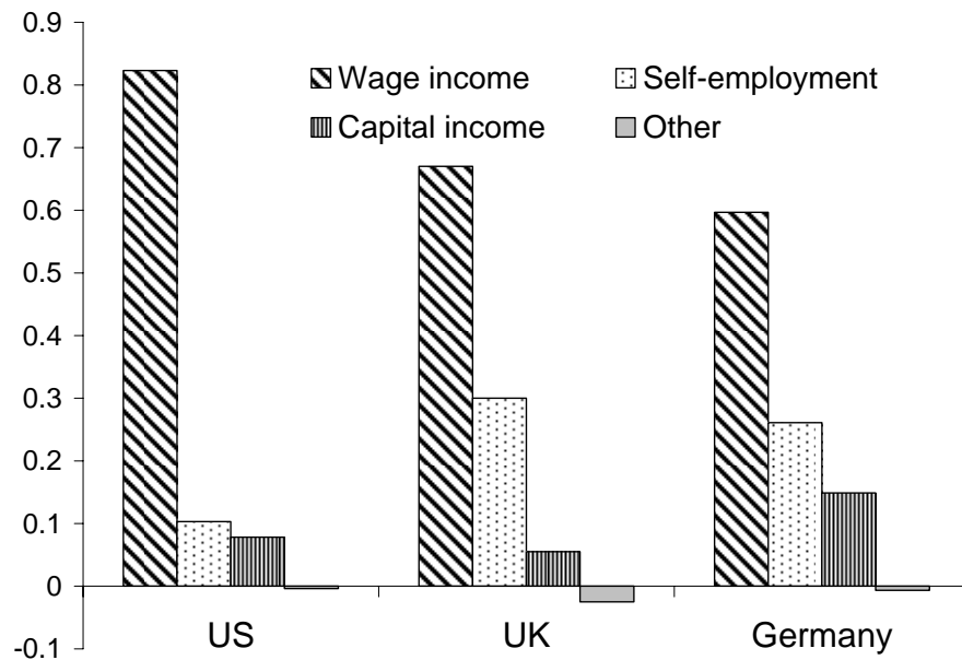
Figure 2 – Inequality decomposition – selected countries, 2000