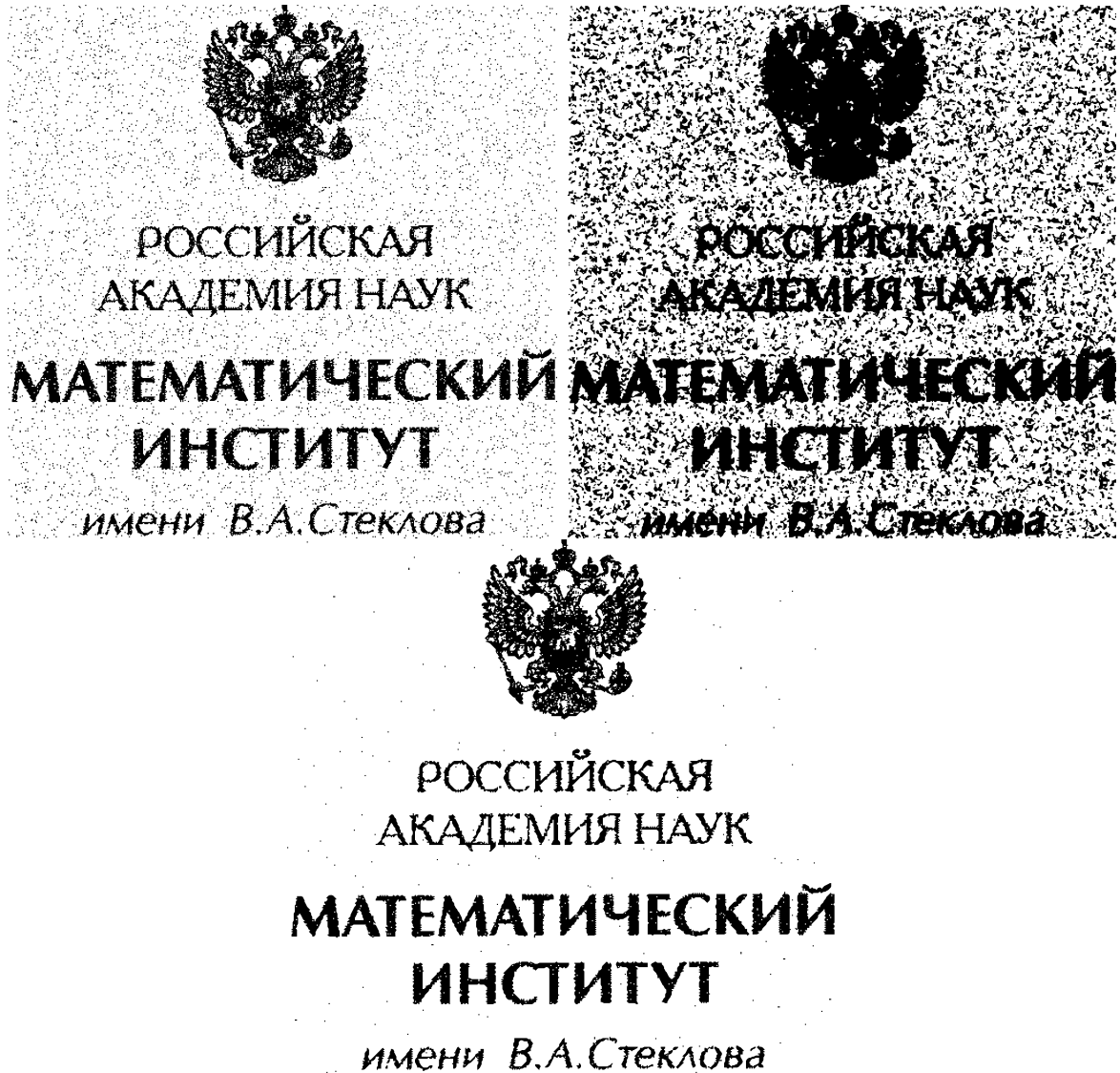
Figure 2: Means based on 10 realizations of the random set. (left-up) The mean corresponding to r_2^2 or \rho_\infty . (right-up) The Molchanov-Baddeley mean. (center-down) The improved Molchanov-Baddeley mean with optimal threshold.