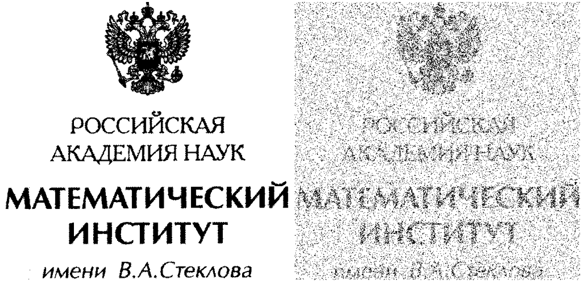
Figure 1: The original image (left) and realization of the corresponding random set (right)

The difference (7) is less than zero also.