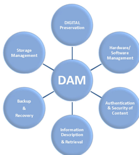
Fig. No. 1 - The Activities of Digital Asset Management

The third key function for a DAM system is to provide a media database that can render and deliver content into automated publishing applications.