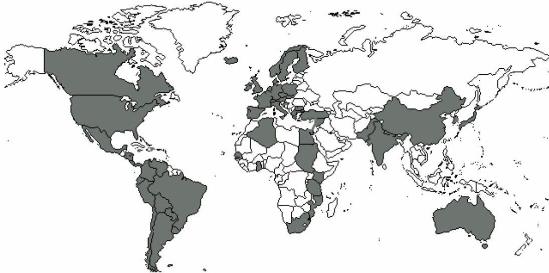
Figure A.1. Selected countries.

Algeria Argentina Australia Austria Belgium-Luxembourg Bolivia Brazil Bulgaria Canada Chile China Colombia Costa Rica Croatia Cyprus Czech Republic Denmark Dominican Republic Ecuador Egypt, Arab Rep. El Salvador Finland France Germany Ghana Greece Honduras Hong Kong, China Iceland