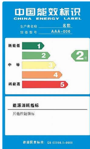
Figure 2 China Energy Label