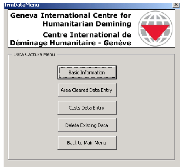
Figure 2: CEMOD Data Capture Menu

In the ‘Costs Data Entry Menu’, users are asked to enter data on the actual or projected costs of the mine clearance project. The costs in the model are grouped into four categories: staff salaries; staff allowances; consumables and running costs; and capital equipment. Within each of these cost categories there is no restriction on how many cost items are specified. Thus, the model can handle both analyses of past costs, based on detailed budgets, as well as projected costs where there might be rather less detail available. For each cost item, the user is asked to specify a name or description for the item, the number of items used, and the unit cost per item per year.