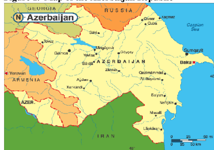
Figure 1. Map of the Azerbaijan Republic

The independence of the Azerbaijan Republic was recognized by the United States on December 25, 1991 and diplomatic relations were established on February 28, 1992. A significant part of economic relations between both countries is concentrated in