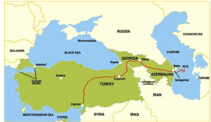
Figure 2. Baku-Tbilisi-Ceyhan main oil export pipeline.

tons of nominal fuel unit. Total investment for the contract is about $ 15 billion. The ACG is one of the largest fields under development in the country.