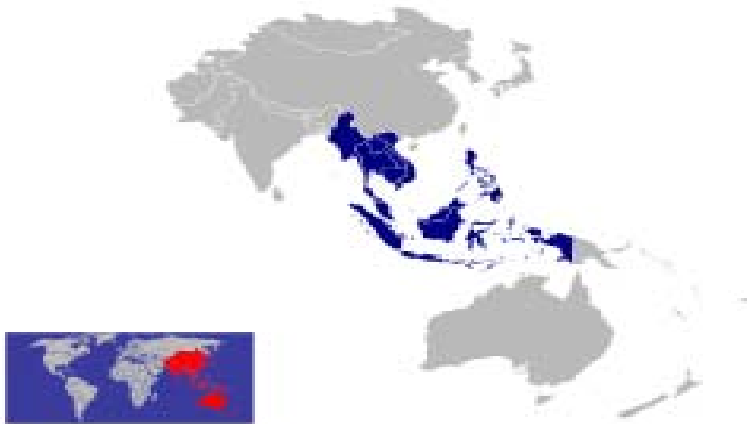
The Economic Comunity A.S.E.A.N. (Source: http://en.wikipedia.org/wiki/ASEAN ).

The single market should number over 530 milion persons form ten states: Malaezia, Indonezia, Singapore, Brunei, Thailanda, Filipine, Vietnam, Laos, Myanmar (Birmania) and Cambogia.