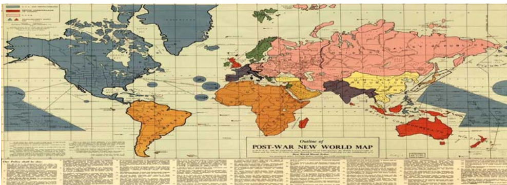
Post war map proposed by the visionary in 1941.

We will now analyze the actual aspects and the premises for the future regarding the political economic integrative organizations that are formed in our days at continental level.