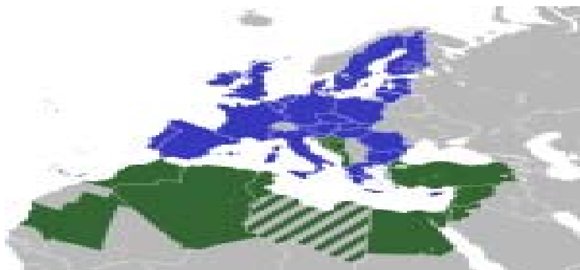
The Mediterranean Union – member states (Source: http://en.wikipedia.org/.../Union_for_the_Mediterranean ).

Egypt, Turkey and Morocco (the last one bothered by the recognize of the Democratic Arab Republic of Saharawi's independence by its African partners) have agreed upon a close political relation with the European Union. The North African states share the same opinion towards the creation of a political state union in Africa.