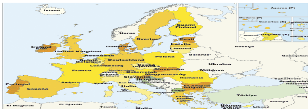
The E.U. states.

Currently, the Union is in an expanding process as other three countries – Croatia, The Republic of Macedonia, and Turkey are candidate in acceding at the membership of the European Union ( ro.wikipedia.org/wiki/Uniunea_Europeană ).