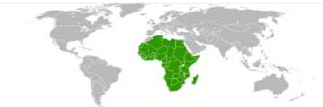
The African Union (Source: http://www.africa-union.org/ ).

Initially, the Pan African Parliament only had a consult role, but now it also has legislative powers. It has 265 members that are also members of the national Parliament of the 53 component states ( http://en.wikipedia.org/wiki/Uniunea_African_Union ).