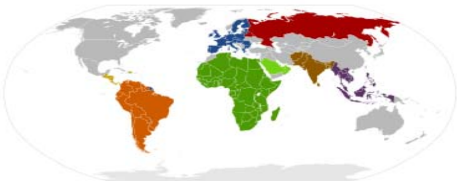
Continental unions in present period. These take form of political economic integrative organizations.