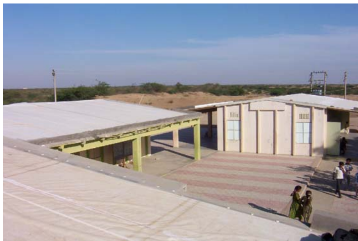
Figure 2: Dew Harvest System at Sayara (CoR)