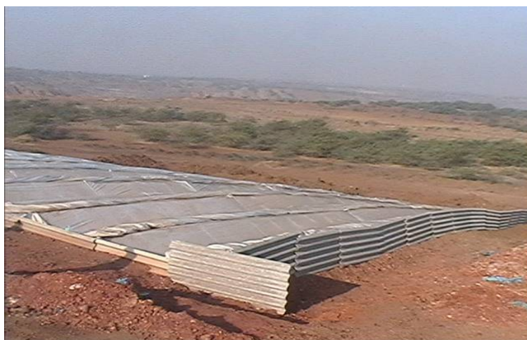
Figure 3: Dew Harvest System Panandhro (CoG)