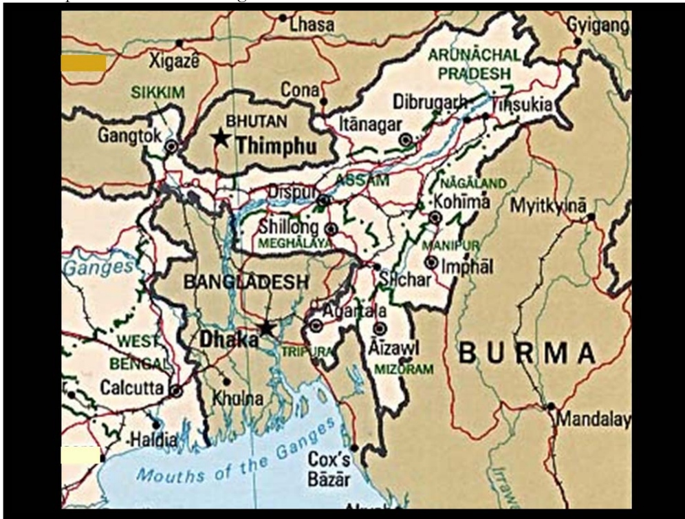
Exhibit 3: Map of North Eastern Region