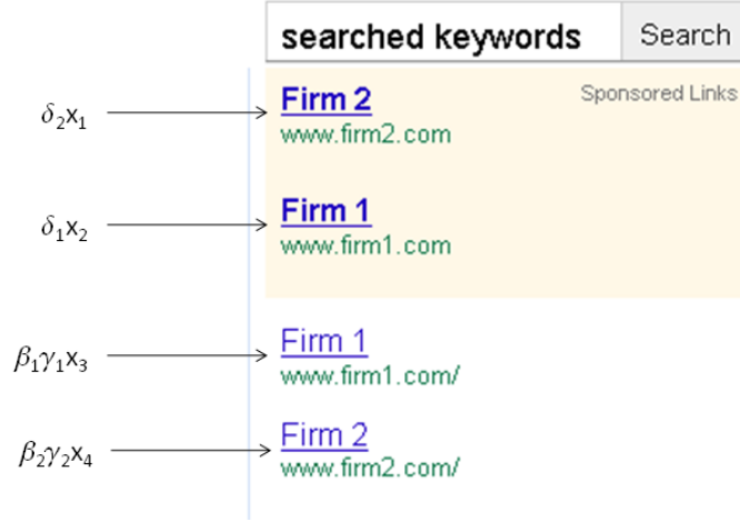
Figure 1: Example of search engine results when firm 2 is awarded the first sponsored link