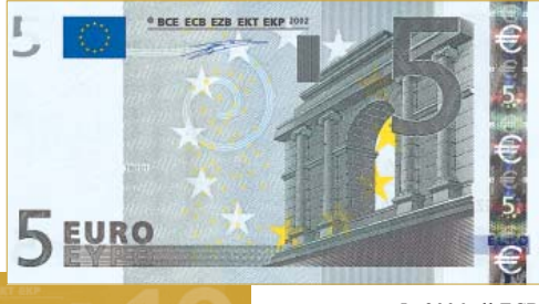
In 2006 all ECB publications will feature a motif taken from the €5 banknote.