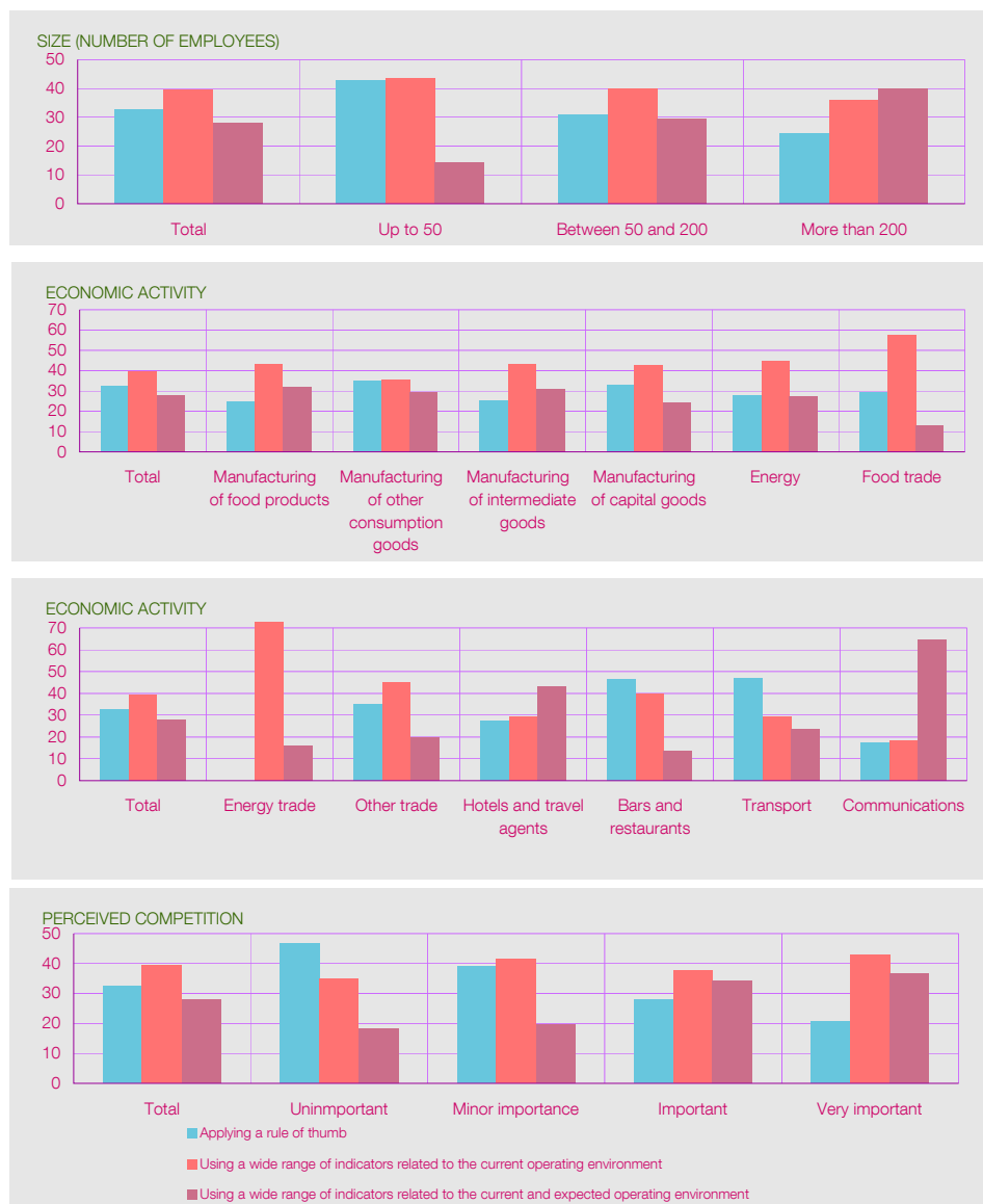
Figure 3 - Information set used in the revision of prices (Question B6) How do you recalculate the price of your main product?

related to the company's current and expected future operating environment". These three options reflect different degrees in the optimality of price setting strategies. Companies applying rules of thumb (for instance, changing prices by a fixed percentage, or following a CPI indexation rule 17 ) may end up charging a price that is far from the optimal one if a large shock occurs. In this sense, these companies behave non-optimally 18 . At the other extreme, price reviews are addressed in an optimal way if companies use a wide set of indicators relevant for profit maximisation, including expectations on the future economic environment.