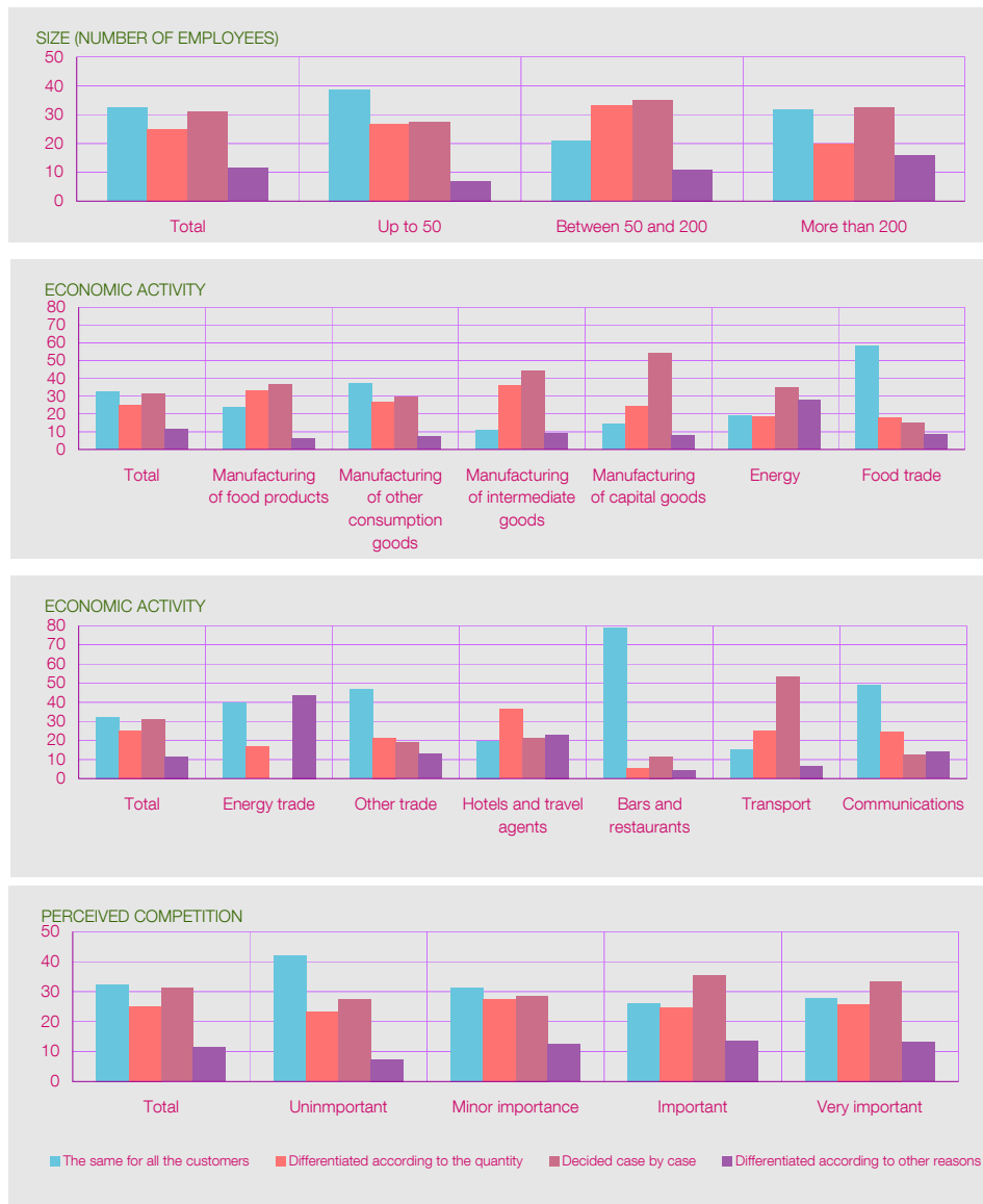
Figure 5 - Price discrimination (Question B3) The price of your main product is:

the amount sold, 30% declare that the price charged is decided on a case-by-case basis and 11% mention other criteria 21 to justify differences in the price charged.