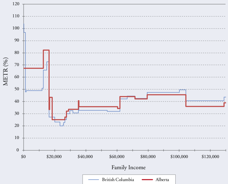
Figure 2: Marginal Effective Tax Rates (METRs) for a Typical Single Senior Individual, 2011