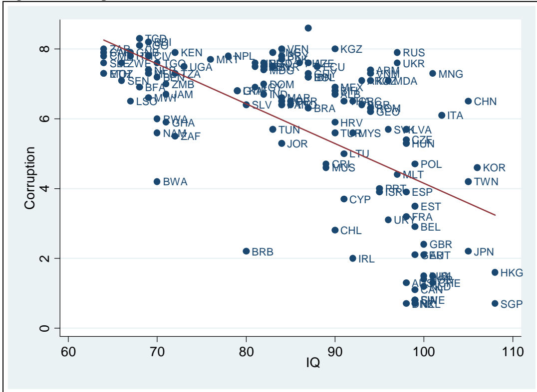
Correlation coefficient: -0.63. Source: Transparency International (2010) and Lynn and Vanhanen (2006)