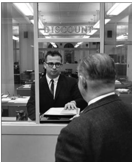
In its early days, the discount window was a physical window located within each regional Federal Reserve Bank, as shown in this 1960s photo of the window inside the New York Fed.

The Fed would much prefer that banks obtain funds from this private source. But banks are rational, and one would expect them to go to whichever funding source is cheapest. Prior to 2003, that was the discount window. The Fed kept the discount rate below the target fed funds rate and limited arbitrage by scrutinizing the banks that borrowed.