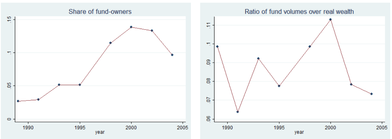
Figure 2: Trends in share of fund-owners and in ratio of fund volumes over raw income