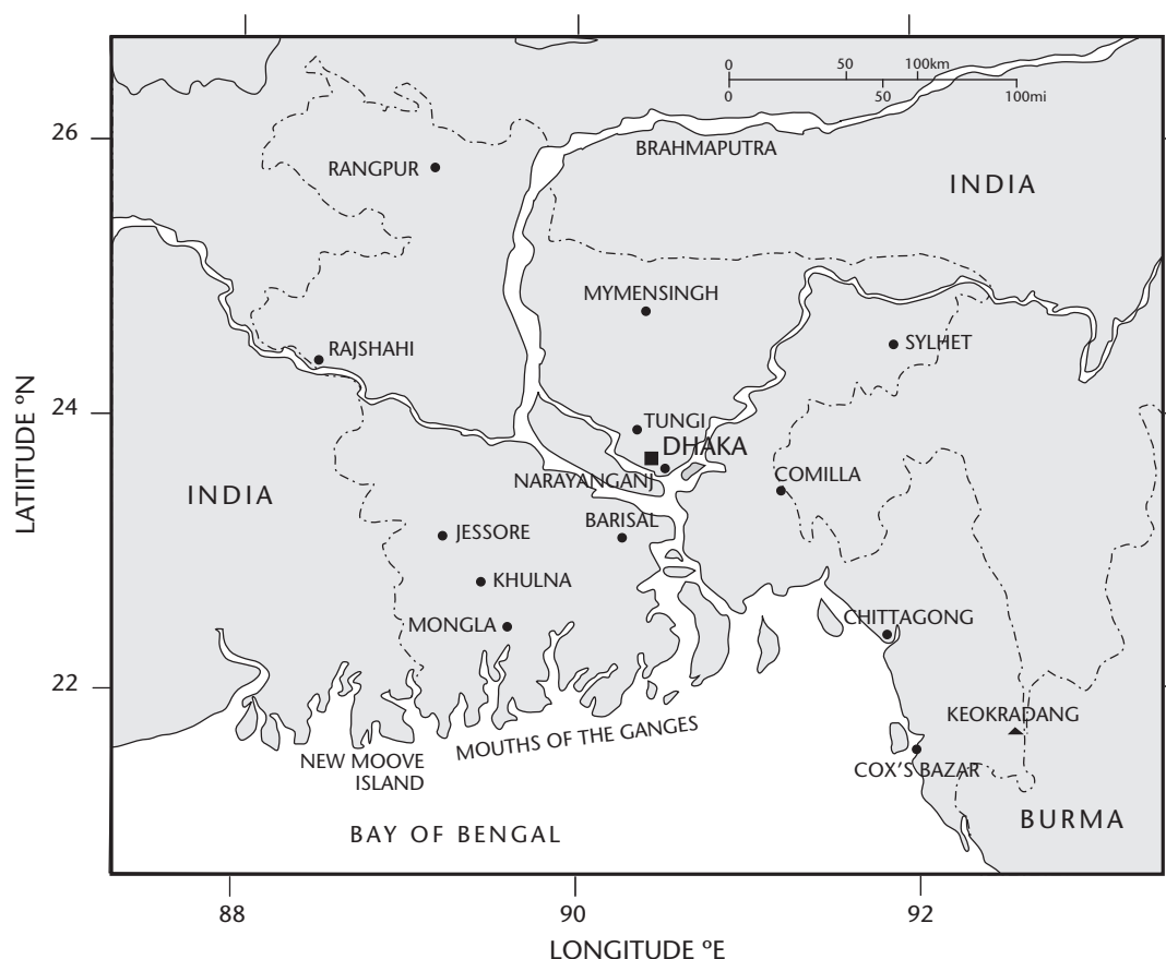
Fig. 1. Map of Bangladesh.

Bangladesh declared an Exclusive Economic Zone (EEZ) of 200 nautical miles (370 km) in 1974. As a result, an area of about 166 000 km 2 is now under the economic jurisdiction of the country for exploration, exploitation, conservation and management of its living and non-living resources. Several surveys have been conducted by national and international agencies to assess and estimate the marine fisheries resources potential of Bangladesh since 1958. Most of these surveys were of an exploratory nature and repeatedly targeted the demersal fishery resources. These surveys gave good information on the standing stocks of demersal finfish and shrimp. However, no detailed surveys were conducted for pelagic fishery resources.