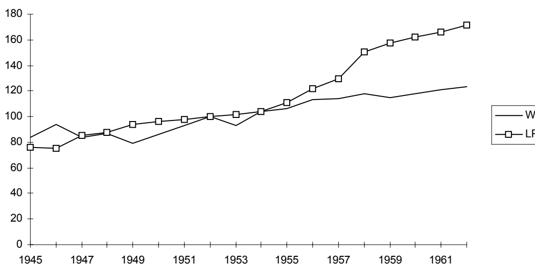
Figure 2 - Wages and labor productivity in Brazil, 1945-1962

Overall trends of the data can be visualized before a more detailed analysis in the next sections. Thus Figure 2 shows that, for most of the 1945-1962 period, labor productivity exceeded real wages in Brazil's manufacturing industry, in particular from 1955. Tests of structural stability by using a regression model with dummy variables show that there was a change in the level and the slope of Brazil's labor productivity series, indicating the existence of a structural break in 1955 – an outcome not replicated by wages. 9 Such a result is revealing since the 1950s were a period of remarkable economic growth in Brazil – [quote Brazil's compound rate of growth based on oxlad]. The economic causes of such a negative performance of manufacturing wages still remain to be investigated and are beyond the scope of the present article. An effect, however, can be deduced from the previous analysis: given the boost in productivity and the relatively slow growth of wages after 1955, firms experimented an increase in their profits at the expense of workers' wages.