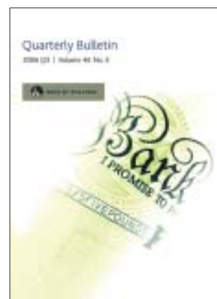
Quarterly Bulletin 2006 Q3.