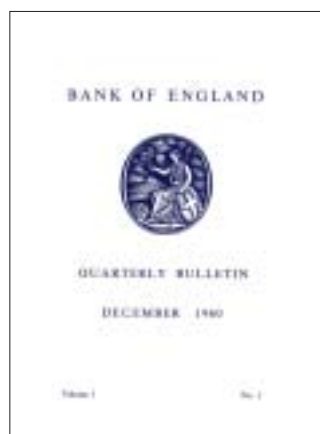
Quarterly Bulletin December 1960.