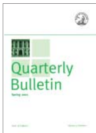
Quarterly Bulletin Spring 2001.