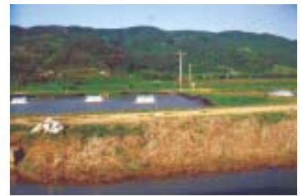
Fig. 4. Typical grow-out ponds with aerators.

Generally, farm-raised tilapia larger than 200 g are well received by consumers and much of the small-