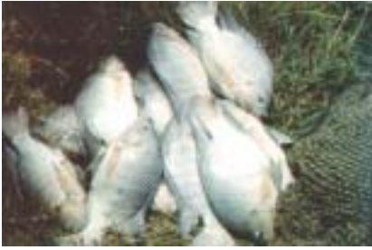
Fig. 1. O. niloticus harvested from a pond in Jamaica.

commercial tilapia culture are provided by Carberry and Hanley (1997). Of the 10 000 km 2 total land area, only approximately 14% is suitable for aquaculture due mainly to the dominance of porous limestone and a relatively limited water supply. Most tilapia farms are located on the south-central plains where clay soils and an extensive system of irrigation canals installed by the sugar cane industry provide the water supply infrastructure (Hanley 2000). The total aquaculture area is estimated at