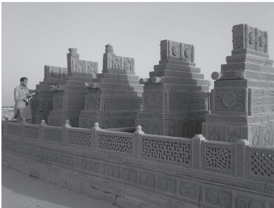
Figure 1. View of tombs at the Chaukhandi necropolis near Karachi, after which tombs of this style may be named