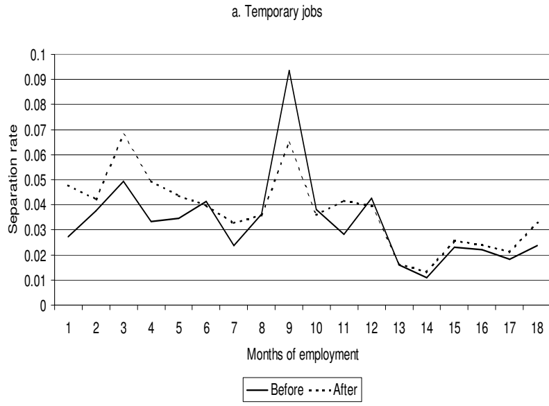
Figure 1: Monthly separation rates by employment duration; males