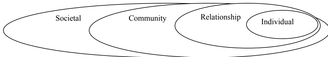
Figure 1.2 Ecological Model

The fact that risk factors operate at multiple levels has important implications for the design of interventions to address GBV. Interventions, to be effective, will generally need to address risk factors at these different levels of aggregation. 12 Thus, we use the ecological model as a way to organize the presentation of the good practice interventions in the following sections. (See Figure 1.2 for a graphical representation of the ecological model.)