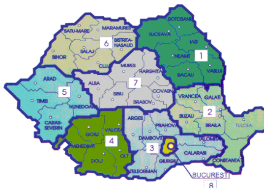
Figure 1 Romania's eight development regions

association of neighbouring counties. The development region is not an administrative and territorial unit and has no legal personality.