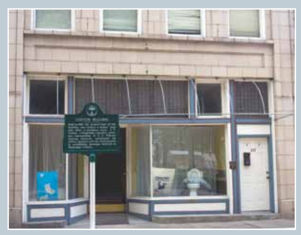
A vacant plumbing supply store downtown was donated by the landlord to the city, which hopes to renovate it for re-use. The city is asking other absentee landlords of empty buildings to do the same.

Creative Foods Inc., which makes tomatobased sauces, margarine and other oil-based spreads. American Greetings Corp. got $550,000 for electrical upgrades when the growing company was hiring.