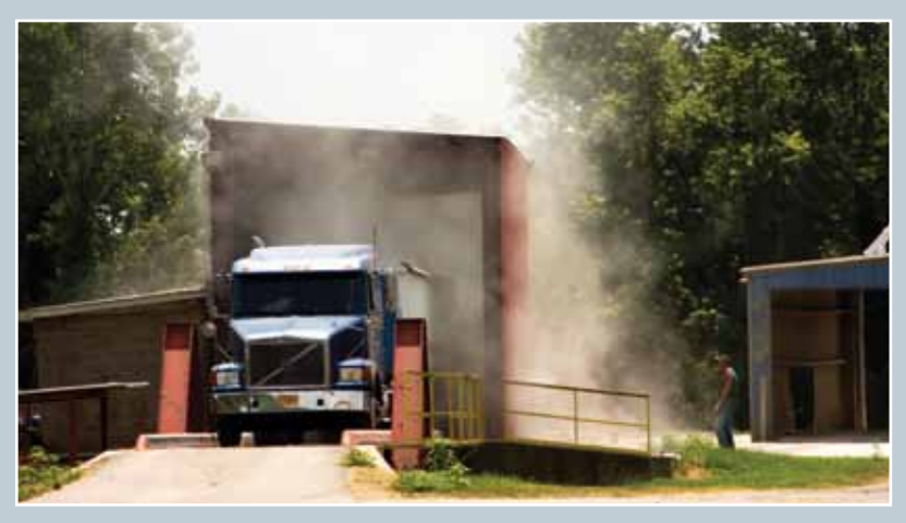
A truck delivers grain from nearby farm fields to Osceola's port, already the busiest in Arkansas and being expanded to twice its current capacity. The city is spending $3 million on the improvements.