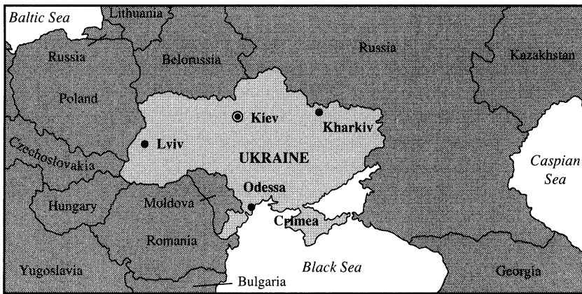
Figure 2. Geography of Ukraine

western parts of Ukraine were incorporated from Poland only at the end of the Second World War, a record reflected in the greater concentration of ethnic Ukrainians and political radicalism in Lviv (see figure 2). The eastern and southern parts of Ukraine, especially Crimea, Odessa and its oblast, and Kharkiv oblast, contain a large Russian population and were the targets of a recent, hastily withdrawn, territorial claim by the Russian Federation. 27 Reportedly little more than a third of this Russian minority speaks the now politically correct Ukrainian language. 28