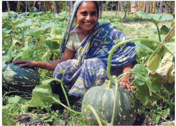
Homestead food production, Bangladesh.

Yet investments in agricultural development have generated sizable dividends for society, demonstrating that agriculture is not only an important means of reducing poverty, but also a worthwhile investment portfolio.