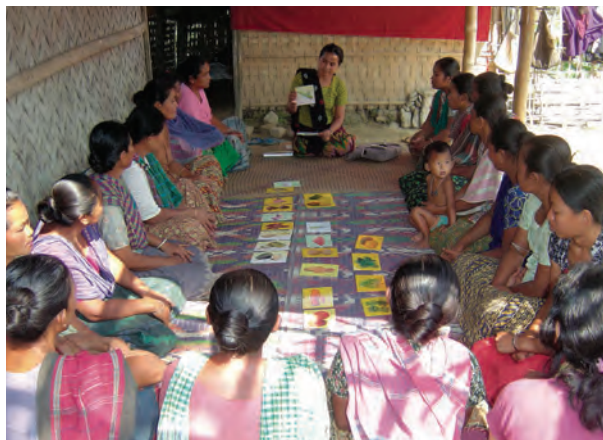
Nutrition education class, Bangladesh

Science and technology. Sustained investment in agricultural research and development is vital to developing-country agriculture. The application of science and technology to agricultural development—whether by developing advanced techniques for crop breeding or updating farmers’ traditional soil and water management practices—is a common determinant of success. The critical role of long-term public investment in science and technology plays out across the entire developing world and across a range of successes from major food crops to lesser-known crops and to livestock and fisheries.