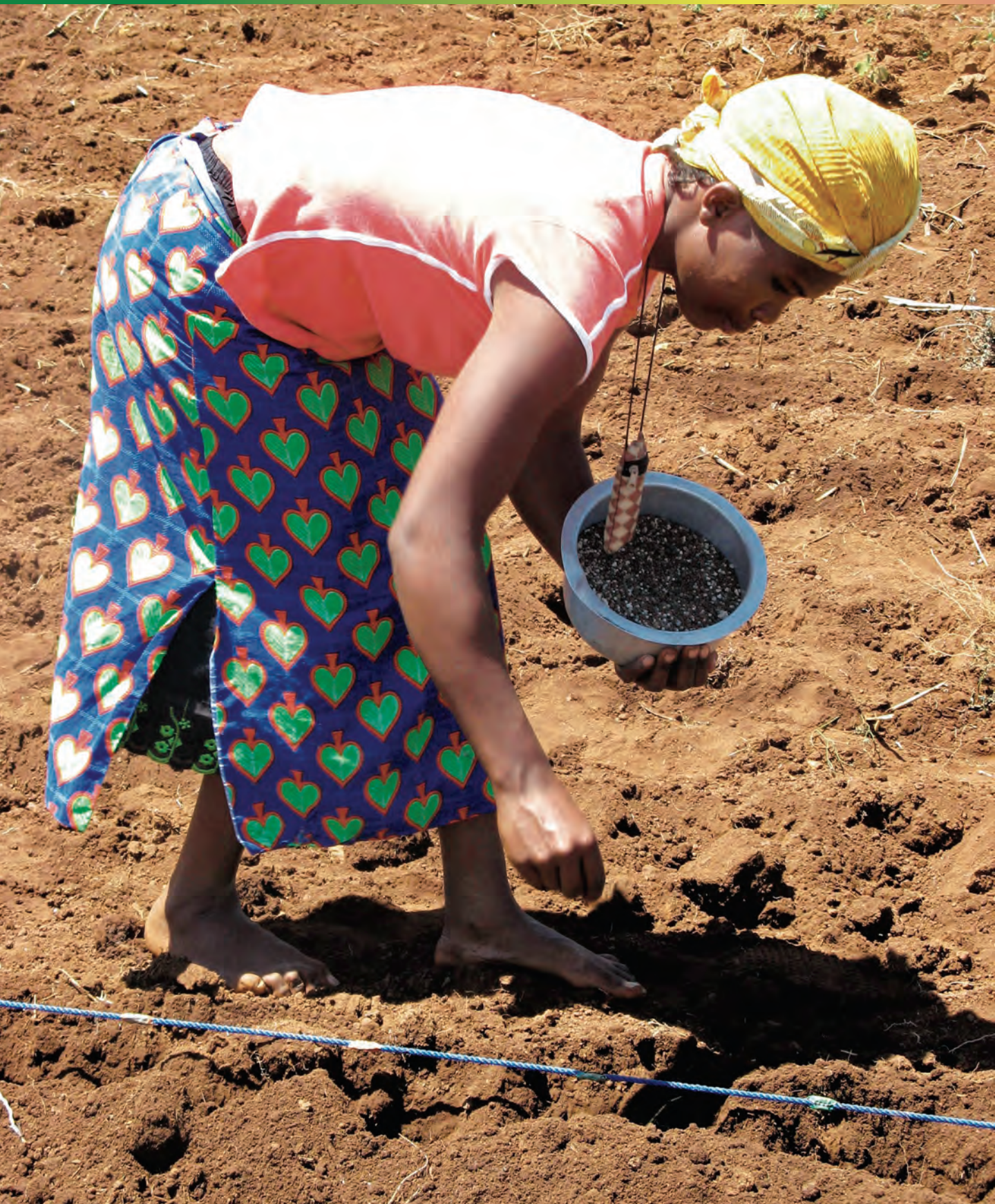
Farmer applies fertilizer to maize, Kenya.