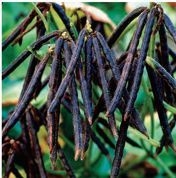
Mungbean cultivation, Asia.

Global efforts to control and eradicate rinderpest—a livestock disease that, in its severest form, is capable of killing 95 percent or more of the animals it infects—reiterate the importance of livestock to rural livelihoods and food security. Concerted global, regional and national