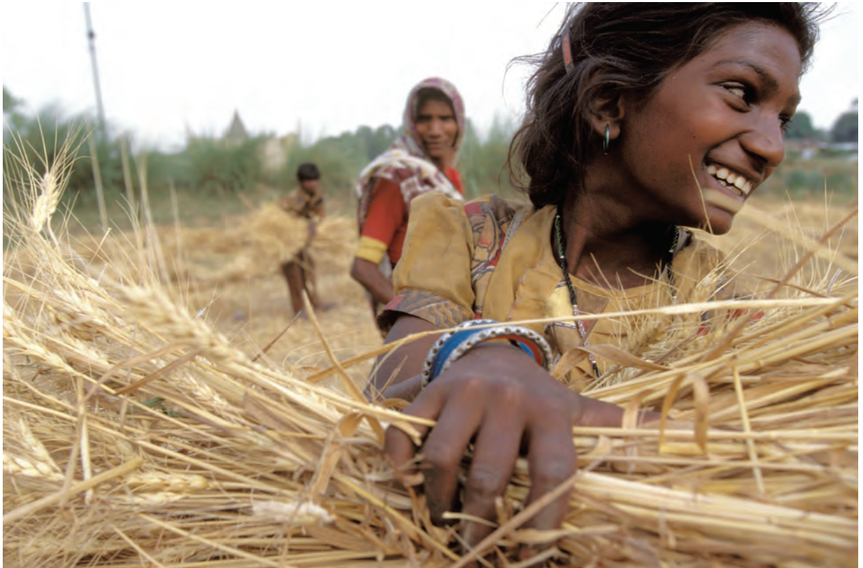
Family harvests wheat, India.