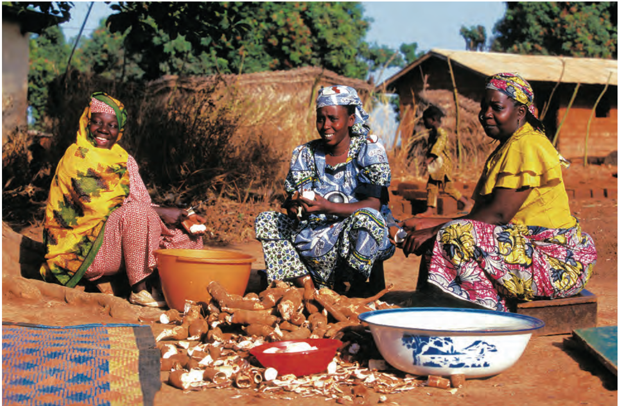
Processing cassava, West Africa.

to finding scientific solutions to ending hunger and food insecurity.