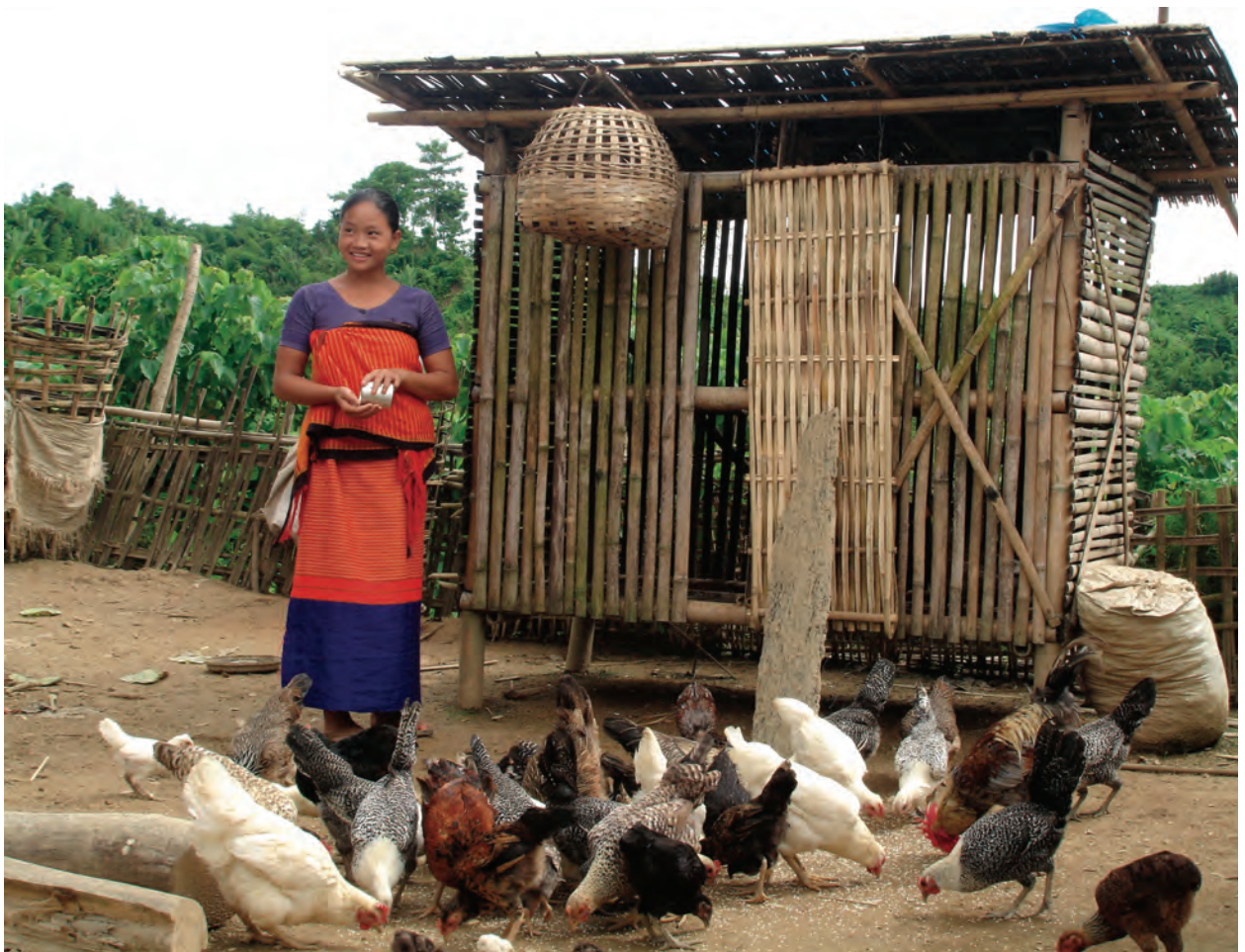
Smallholder poultry farming, Bangladesh.

While massive gains in improving the availability of and access to food were achieved in China, India, and many other developing countries as a result of these successes, far less has been achieved in improving the quality of food. Scholars have argued that the decades-old effort to raise people’s incomes to boost their calorie consumption and protein intake should be refocused to include improvements in people’s micronutrient intake and dietary