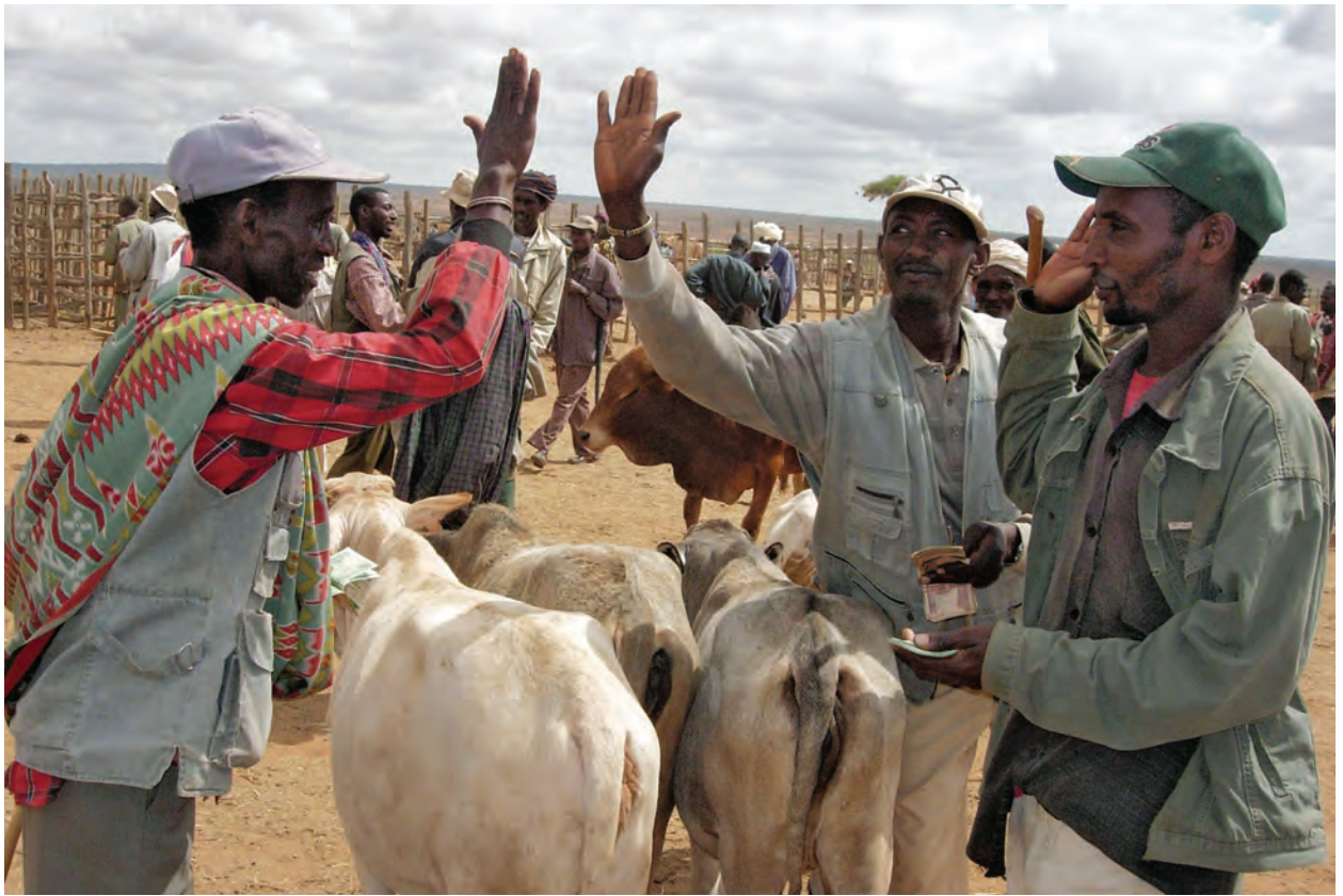
Trading healthy cattle, Ethiopia.

of land in the Indo-Gangetic Plains and generating average income gains of US$180-340 per household, particularly in the Indian states of Haryana and Punjab.