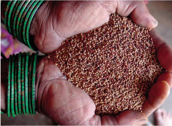
Millet seed ready for planting, India.

effectively, orchestrating foreign assistance and community resources, and managing relationships among sometimes disparate interest groups.