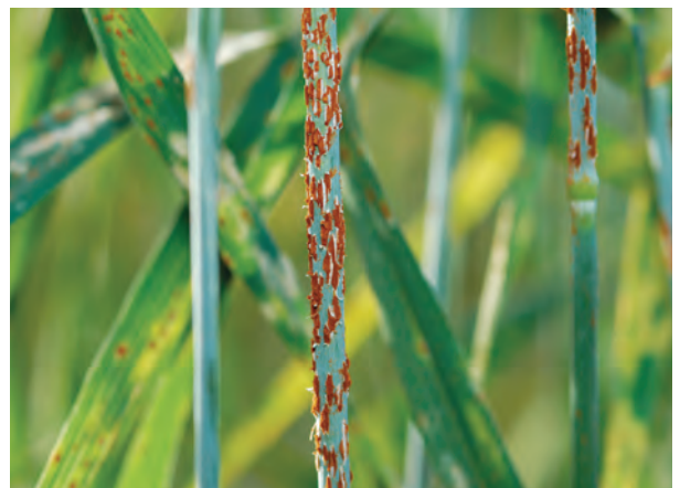
Wheat infected with stem rust.

One of the first major successes came from a global effort to fight wheat rusts—a plague that has been known to humanity for thousands of years but had never been effectively contained. Wheat rusts are actually fungi that can rapidly decimate wheat as it matures in the field, and are thus a threat to food security in industrialized and developing countries alike. The late Nobel Prize Laureate Norman Borlaug, with the eventual backing of policymakers, scientists, and philanthropists, catalyzed a global effort to combat the scourge by bringing modern science to bear on the problem—by breeding rust-resistant wheat varieties in Mexico with the help of innovative research methods. This global effort helped protect about 117 million hectares of land under wheat cultivation from wheat rusts, directly ensuring the food security of 60 to 120 million rural households and many more millions of consumers. Importantly, this global effort also secured a place for science and technology in developing-country agriculture and gave rise to a global agricultural research system, including the Consultative Group on International Agricultural Research, dedicated