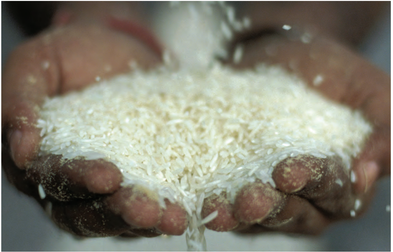
Freshly milled rice, India.

to account for 90 percent of the increase in rice production in Bangladesh between 1988 and 2007. And with this growth in rice production came a decline in the real rice prices facing food-insecure households and ultimately significant reductions in poverty in the country.