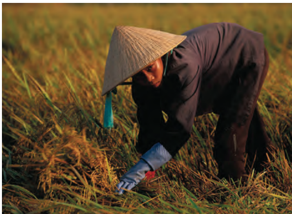
Farmer harvests rice, Vietnam.

In Vietnam, a series of similar reforms between 1987 and 1993 fundamentally shifted the country's economy to a greater market orientation, immediately transforming the agricultural sector. During the period 1989–92, the agricultural sector emerged from its stagnation and grew at a rate of 3.8 percent per year, while the country shifted from being a net food-importing country to the world's third largest exporter of rice in 1989. Within