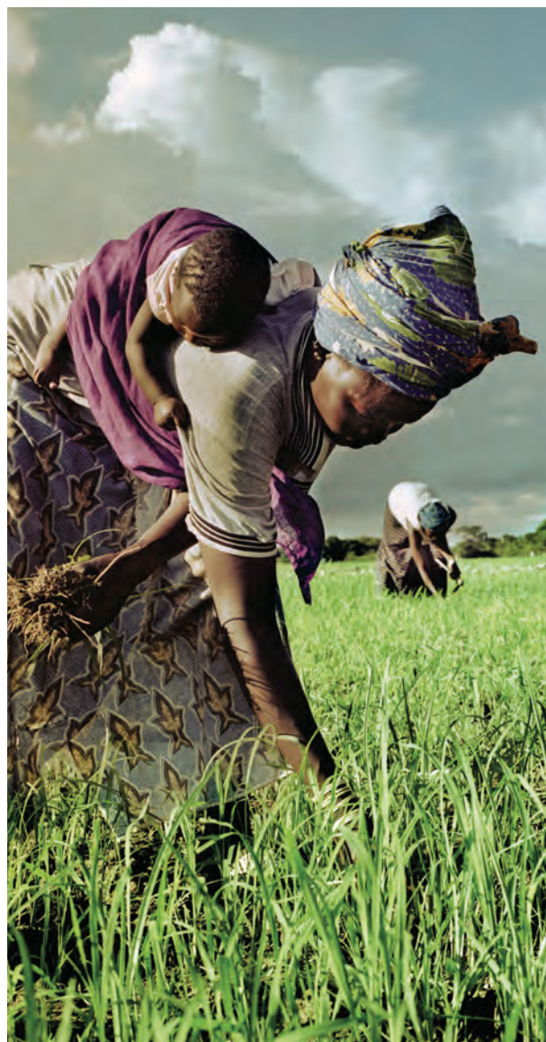
Mother and child farming together, Kenya.

nongovernmental organizations, farmers began innovating on simple practices: protecting and managing indigenous trees and shrubs among crops to provide fodder and firewood and to improve soil fertility; digging pits on barren, degraded land to concentrate organic manure and rainwater for planting; and constructing