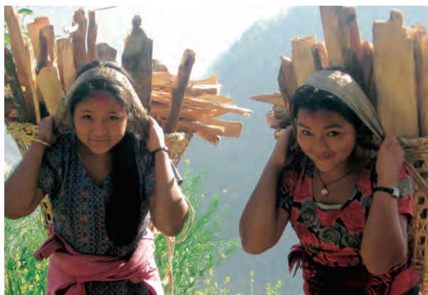
Participation in community forestry, Nepal.

By the 1970s, concerns emerged over the equity and environmental implications of rapid agricultural development. These new concerns encouraged a move away from a strictly yield-increasing outlook on food staple productivity to a more complex perspective on agriculture and rural development. Sustainable development issues came to the forefront of the development discourse, partly in response to issues accumulated during the Green Revolution, such as the overuse of agricultural chemicals, the depletion of scarce water resources, and the neglect of farmers' input into policymaking. New policies, programs, and investments were specifically designed to integrate rural communities into decisionmaking processes