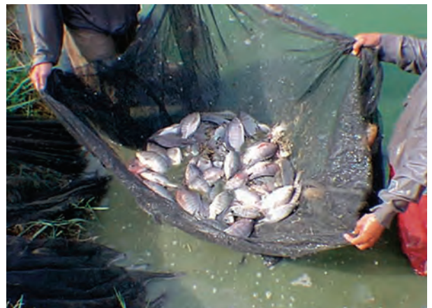
Harvesting farmed tilapia, Philippines.

With the backing of a supportive policy environment that ensured the dairy industry's steady growth and development, India went from being a net importer of dairy products to a major player in the global dairy market. Between 1970 and 2001, dairy production in India increased at the respectable rate of about