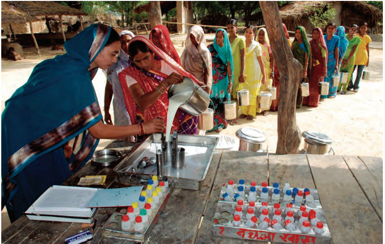
Smallholder dairy producers measure milk, India.

efforts in recent decades to control the spread of rinderpest through cattle vaccination, quarantine measures, and disease surveillance have played an important role in securing the livelihoods of small-scale farmers who keep livestock, as well as pastoralists whose livelihoods depend primarily on the health of their herds. Programs operating in Asia and Africa have helped to avoid potentially massive financial losses in terms of milk, meat, animal traction and, for many pastoralists, their main livelihood assets, and have brought rinderpest to the edge of eradication, the first time an infectious disease has been eradicated since smallpox in humans.