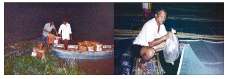
Figure 13. Fish seeds shifting to cages Figure 14. Fish seeds stocking in cages

conditioning at the site of procurement and acclimatization at the site of release in cages. Conditioning is required to transport the fry with empty stomachs, as the ammonia and carbon dioxide generated by fish waste may prove lethal to fry during transport. Fry acclimatization is essential at the site of release in cages to ensure a balanced environment, especially in terms of temperature. The oxygen packets transported with the fry (1,000 fry in 4 litres of water in a polythene packet 2/3 filled with oxygen) are kept inside cages for at least an hour before the fry are released. Prior to release, fry are subjected to some prophylactic measures to protect them from diseases and ecoto-parasites. They are dipped in a 5-6% salt solution as well as potassium permanganate (5-8%) for 1 to 2 minutes and then released into the cage water.