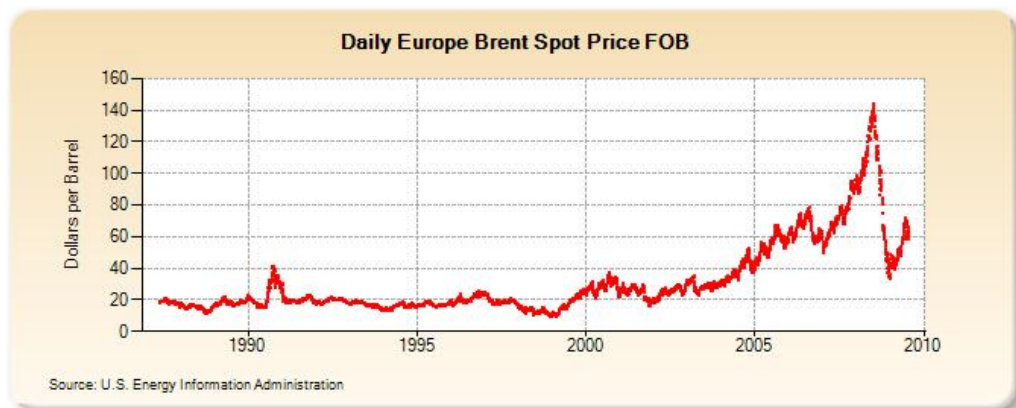
Figure 2 Oil prices, 1987-2009 US$ per barrel

Source: US Energy Information Administration. Available at: www/tonto.eia.doe.gov/dnav/pet/hist/wtotworldw.htm