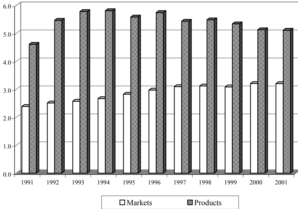
Figure 1: Average Number of Markets per Firm and Products per Firm