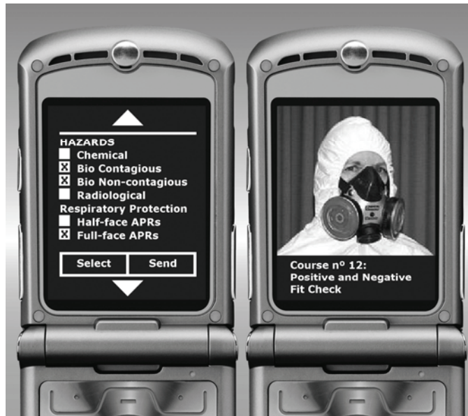
Figure 2. Cell phone displaying a multimedia message.

Information in the JITTER is organized into three components: (1) Emergency Information, (2) Emergency Training, and (3) Authentication. The Emergency Information component contains real-time information unique to the emergency. The Emergency Training component consists of easily assimilated multimedia training modules on important occupational and safety issues related to the agent(s) involved in the emergency incident. The Authentication component contains a minimal (three column) profile of EMP, with names and associated cell phone numbers and training.