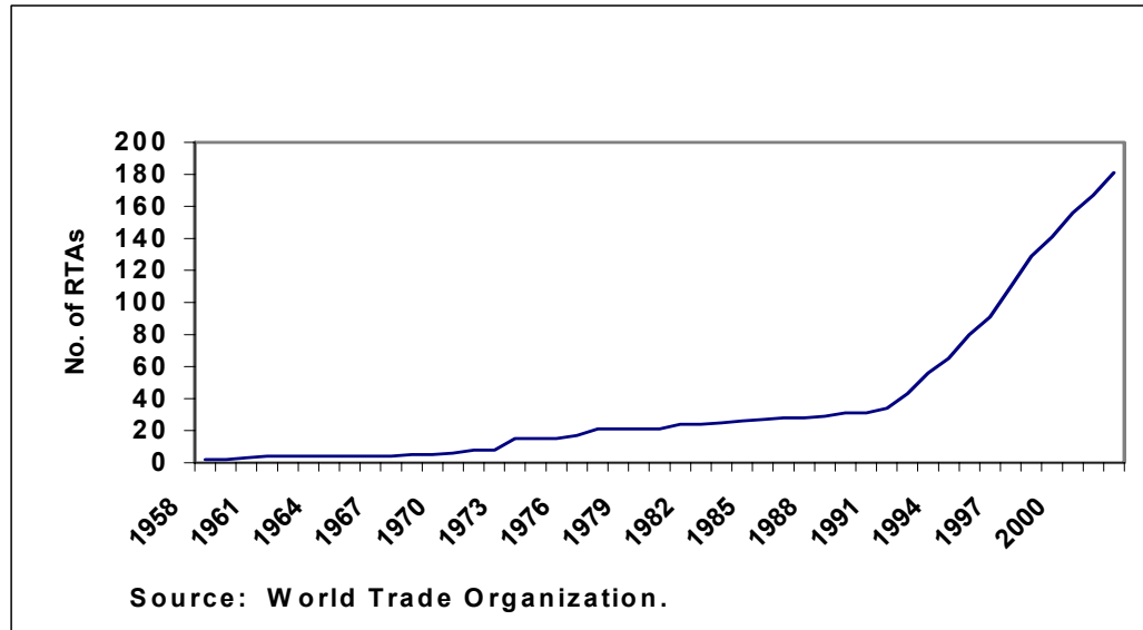
Figure 1—RTAs in force by year of entry into force

In the U.S., Special Trade Representative Zoellick has described the U.S. pursuit of regionalism as a strategy to achieve short-term economic goals, help break the logjam in the multilateral negotiations, and achieve longer term, strategic objectives that can be fostered by trade liberalization. 7 The EU has pursued regionalism aggressively as a means of encouraging investment and competition, and to reinforce a multipolarity in the