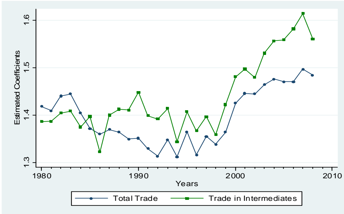
Figure 1: The distance coefficient in total and intermediate goods trade, gravity estimations

This result supports the pessimistic interpretation of the recent finding by Carrère, de Melo and Wilson (2010: 32) that “trade costs can be viewed as a growing impediment in the supply-chain production. Then, if low-income countries’ trade costs (in particular distance-dependant costs such as high mark-ups in international shipping) remain high compared to other developing countries’ trade costs, the observed regionalisation of trade could be interpreted as a marginalisation of these countries.”