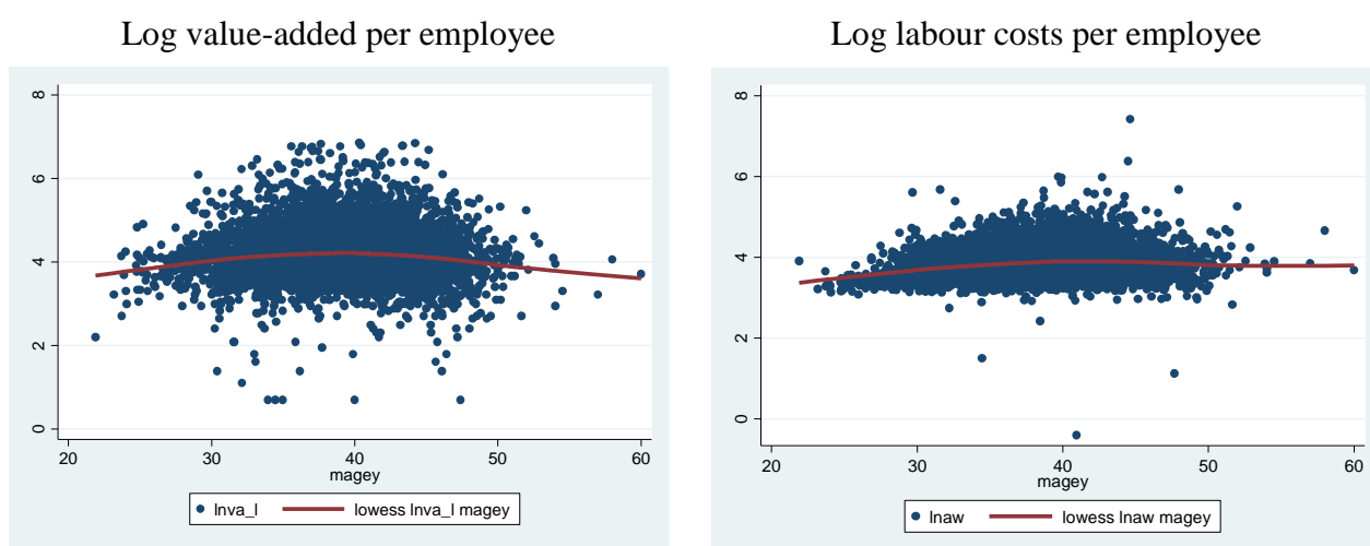
Figure 2: Average age of workers (on the horizontal axis) versus firms' i) log of net value added per employee ii) log of labour costs per employee. Year 2006. Scatter plot and non-parametric regression

Finally, intermediate inputs pay a key role in our analysis, as they are central to our strategy to overcome the simultaneity or endogeneity bias. It is calculated here as the difference between the firm's turnover (in nominal terms) and its net value-added. It reflects the value of goods and services consumed or used up as inputs in production by enterprises, including raw materials, services and various other operating expenses (see last column of Table 1 for descriptive statistics).