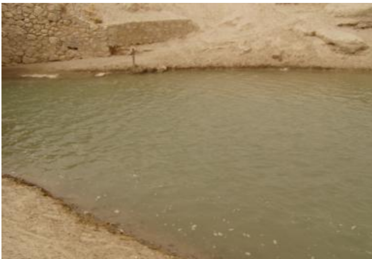
Fig. 31, 32, 33, 34. Different views of rivers Olchin and Govkush near Kunduz; The construction of bridge and management of water intake infrastructures are under the control of different International Donor Organizations.

Closer to Kunduz there are well-irrigated sites due to the use of waters of small river Olchin and canal Govkosh (Fig. 31, 32, 33, 34).