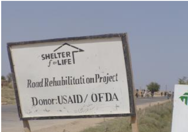
Fig. 41. USAID/OFDA rehabilitation project (Imam-Soheb district)

In Kunduz there is a special experimental station where local scientists with support of ICARDA and FAO reintroduce not only traditional wheat, maize, barley, chickpeas, lentils and other seeds that have been used by Afghan farmers for centuries, but also seeds improved through breeding to be more productive and disease tolerant as well as new seed varieties that have been bred to grow in conditions similar to those in Afghanistan so that crop diversification can be introduced.