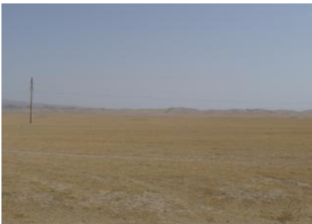
Fig. 25. Landscape of Obdon steppe (foothills semidesert range)

The Obdon steppe with about 70 thousand ha of virgin semidesert lands is the most important grazing area where a large number of nomads graze their livestock on a seasonal basis. The landscape as seen on Fig. 25 and 26 is characterized by flat stony and loamy sandy soils that mostly are not fixed by vegetation.