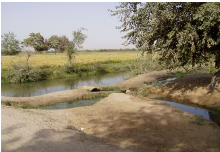
Fig.36. Networks of canals near Khonobad. A view of the irrigation system used for farming rice and fruit-trees

The basic source of water for agricultural reclamation of dry/semidry lands surrounding Kunduz city is the river Kunduz (Baglan), which is fed from the rivers Khonobad and Talikan. Water allocation in the Khonobad district is managed through a series of small canals (Fig. 36).