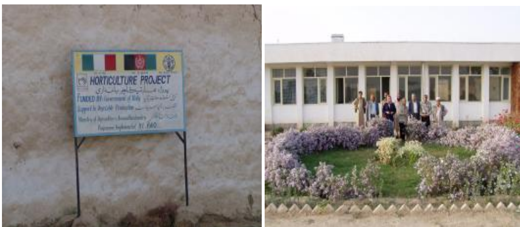
Fig. 42,43. A horticultural project sign, and a meeting at the office of Kunduz Experimental Agricultural Center

The special horticultural and cropping projects have been initiated in Kunduz under the leadership of the Ministry of Agriculture and Water Economy of the Republic of Afghanistan. These Projects are supported by ICARDA, UNDP and FAO (Fig. 42, 43).