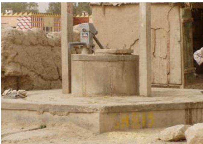
Fig. 12, & 13. Different types of wells widely popular in Kunduz province, used for drinking purpose

construct a mechanical design of wells. Most of them work under financial support of different International Agencies, such as US agency for International Development (USAID) and the Canadian-based International Development Research Center.