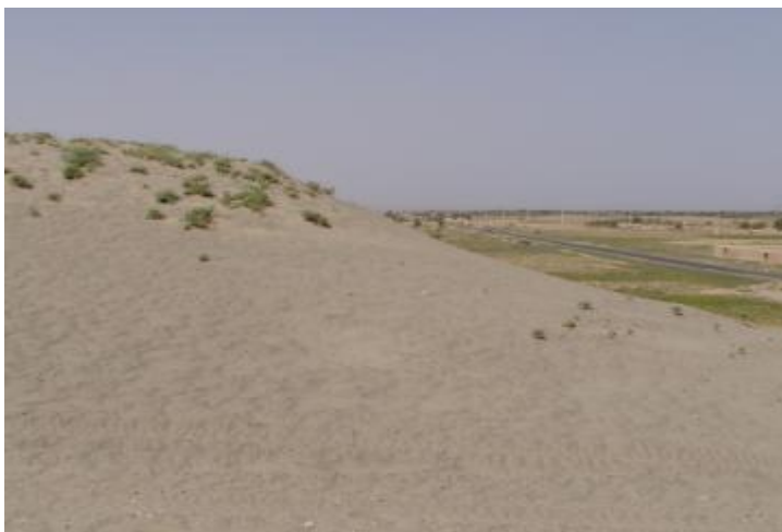
Fig. 22. Sandy dunes with sparse low shrubby/herbs vegetation (Shirmohi desert)

The disappointing features of Afghan sandy desert pastures are their extremely low yielding fodder capacity and especially deficiencies in summer feed. Some strains of Asteraceae , Poaceae , Chenopodiaceae and Fabaceae represent the largest number of plants that are willingly grazed or eaten by all livestock. Different species of Artemisia (about 5% among 100 species common among the flora in Afghanistan) and the Alhagi -herbaceous plant community are the most valuable in terms of yielding capacity, fodder value and plant palatability. Perennials, ephemeroïds and ephemerals species from Poaceae including the genera Stipa , Aristida , Agropyron (wheatgrass), Poa (bluegrass), Arundo (grainreed), Cymbopogon (lemon grass) and Andropogon (bluestem) produce and store satisfactory quantities of fodder biomass for animals. Another important source of forage on patchy sandy/saline lands is represented by different species of Chenopodiaceae , especially Salsola , Arthrophytum , Halostachys , Halocharis , Agriophyllum . Anabasis pastures despite their poor palatability are, perhaps used as fodder reserves for the autumn-winter period (Fig. 22).