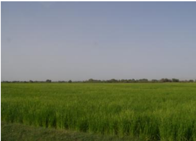
Fig. 37. The general view of a rice field near Khonobad

The experiments on introduction of foreign sorts of rice have not shown positive results yet. A drainage network consisting of small channels between rice cropping fields has been manually constructed. An analysis of the physical parameters of water from this source did not show salinity (Fig. 38, 39).