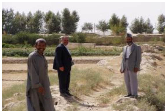
Fig. 7. Network of ground canals in the Pyandzh floodplain near Qarakutermah

These canals form a network from which water flows by its own accord (flooding control) into more distant plots. The water pumping station currently is completely destroyed, and the main canal is in ruins. However, the distributive network has been kept almost intact. This system used to provide sprinkling and potable water for more than 450 local families with their children, who now have to look for a way of