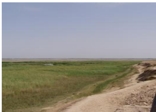
Fig. 6. Farming irrigated lands on the dry river bank of Pyandzh

It was further distributed through the left and dextral networks of shallow ground canals that can still be differentiated (Fig.6, 7).