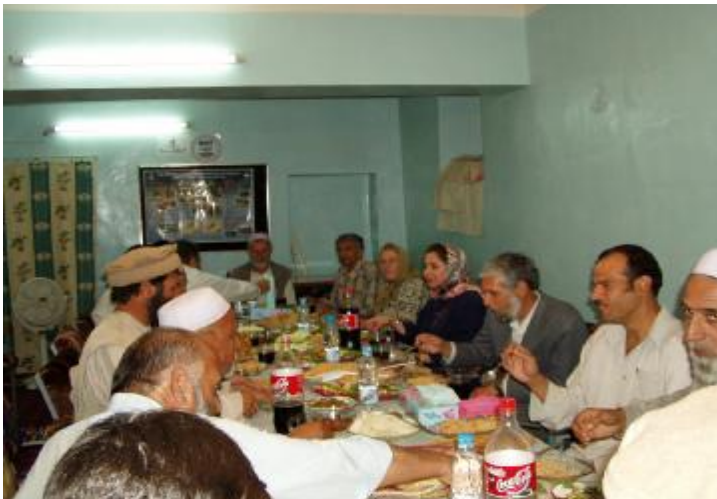
Fig. 48. A meeting at the ICARDA office in Kunduz

Besides, the ICARDA offices in Afghanistan as the one in Kunduz (Fig. 48) provide farmers with vaccines to prevent diseases in Afghan livestock, as well as land in water management.