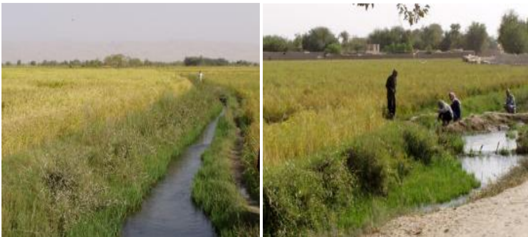
Fig. 38,39. Collector-drainage canals (the participants of expedition doing water analysis in the field).

The experiments on introduction of foreign sorts of rice have not shown positive results yet. A drainage network consisting of small channels between rice cropping fields has been manually constructed. An analysis of the physical parameters of water from this source did not show salinity (Fig. 38, 39).