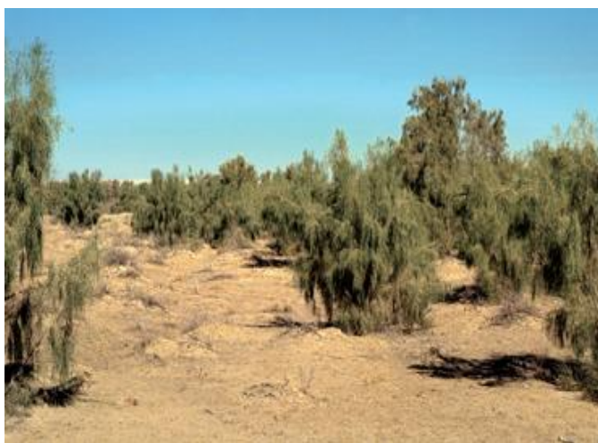
Fig. 21. Karakum desert near Erbent settlement