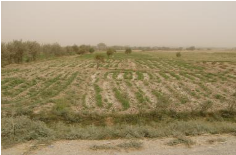
Fig. 35. Co-operative farms activity (near Kunduz city); Crops diversification is well distinguished in here.

The basic source of water for agricultural reclamation of dry/semidry lands surrounding Kunduz city is the river Kunduz (Baglan), which is fed from the rivers Khonobad and Talikan. Water allocation in the Khonobad district is managed through a series of small canals (Fig. 36).