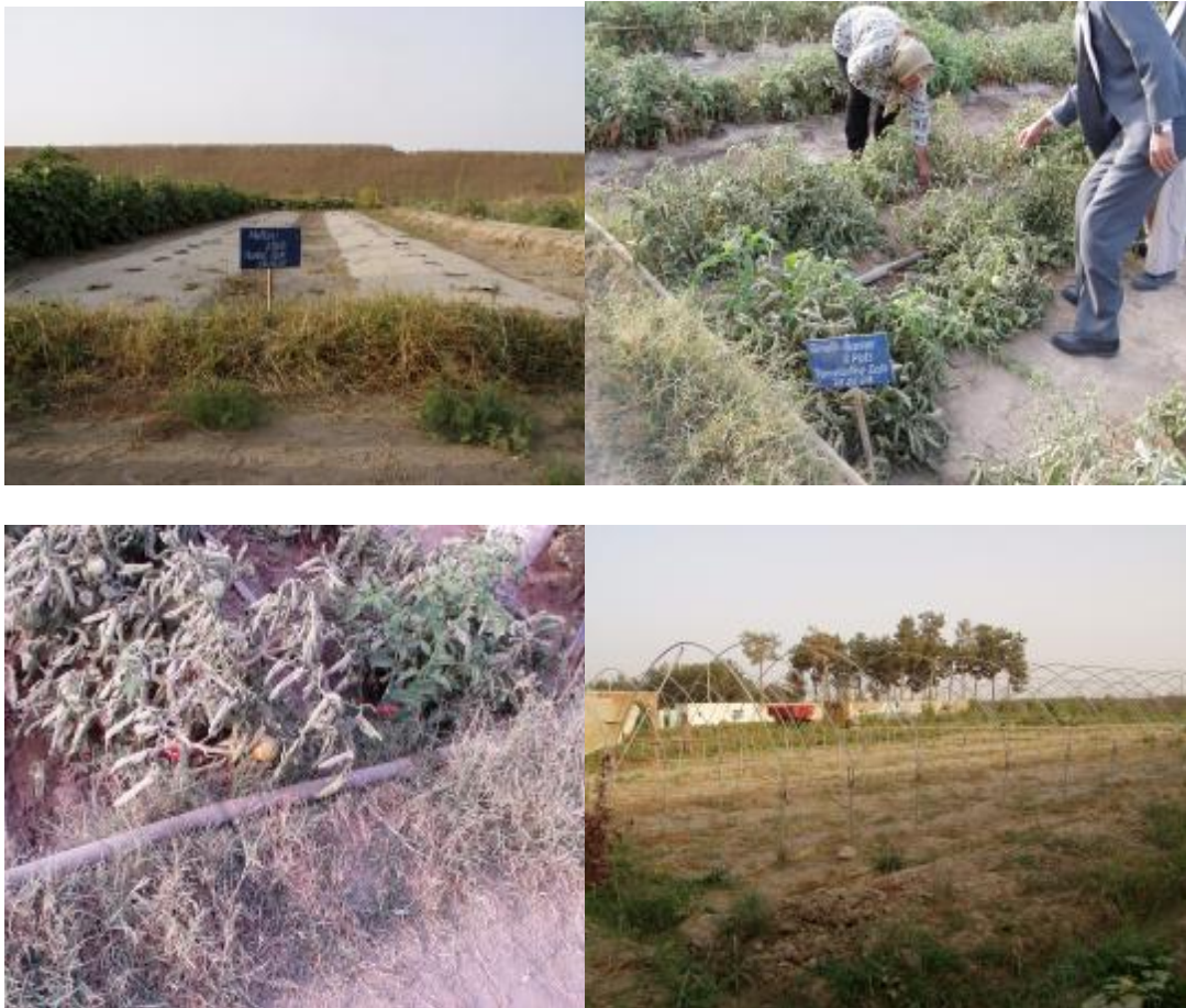
Fig. 49-- 52. Crops cultivation by using of different new irrigation technologies (Kunduz, ICARDA Experimental Agriculture Center)

In recent years the rural agricultural production system in Afghanistan has become increasingly dependent on groundwater pumped from private tube wells. However except for a few studies, little is known how water markets operate presently and what the social and environmental consequences of privatization will be. The private