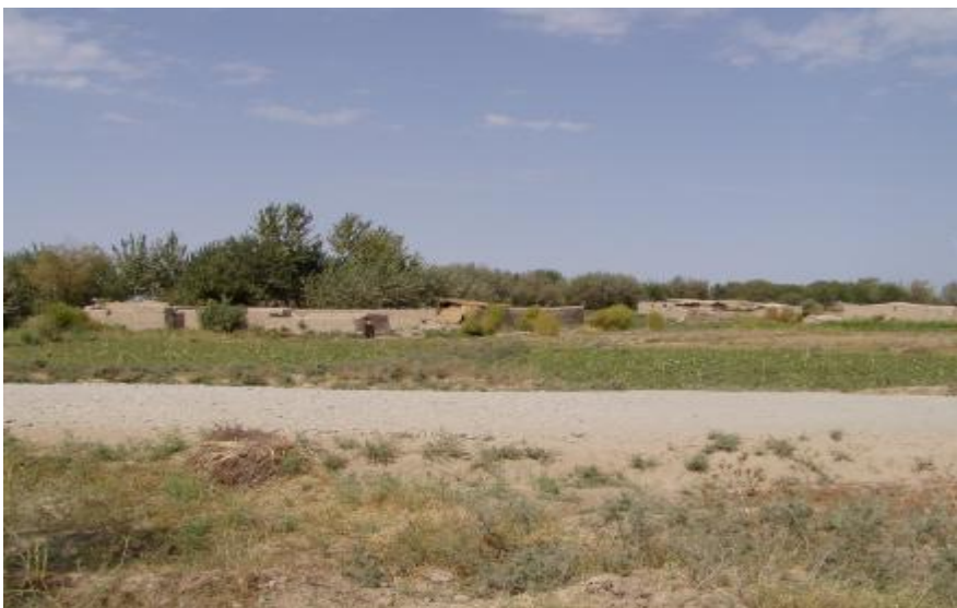
Fig. 40. A typical household farm frequently found in the Imam Saheb district.

Household plots generate a large share of livestock (in the sandy desert and foothill semidesert with grasslands and sparse vegetation areas) and vineyard, fruits (mostly pistachio), melon and gourds crops, potatoes and vegetables. These types of farming activity are most common in the Imam Soheb, Khonobod, Kunduz and Balkh croplands and irrigated areas (Fig. 40).