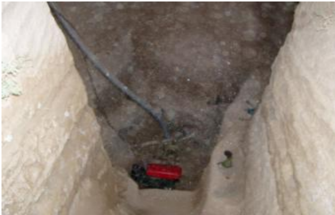
Fig. 14, & 15. A scheme of the built of subsoil water reservoirs (only a few families manage it for their private use)

equivalent of 'Kariz' in China, 'Kanat' in Iran and the Middle East, or 'Foggara' in North Africa (Fig. 14, 15).