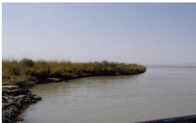
Fig. 2. Floodplain area at the left bank of Pyandzh (Afghan side)

Along the banks of Pyandzh and Kokcha rivers on well-drained areas with deep soils, many of the wild ancestors of cultivated fruit trees occur. These include the apple Pomus spp., pear Pyrus spp. and almond Amygdalis spp. Fraxinus spp., Acer spp., and Plantanus spp. is also found here. Along dry riverbeds there are frequent thorny belts of Stocksia brahuica , Amygdalis communis and Convolvulus spinosus . The floristic characteristics of the region are very variable and depend on humidity, the length of winter, sand composition, wind force and grazing pressure. More humid places have some denser vegetation with richer species in their composition (Fig. 2, 3).