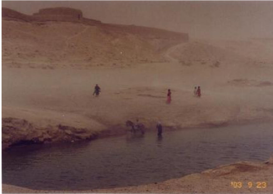
Fig. 27. Local people taking water for drinking needs (Canal Govkush, Kunduz province)

It is equally important to refine methods for plant community rehabilitation and/or regeneration of degraded graminous- Artemisia formations, as well as shrub-semishrubby rangelands on sandy desert and dry riverbank areas.