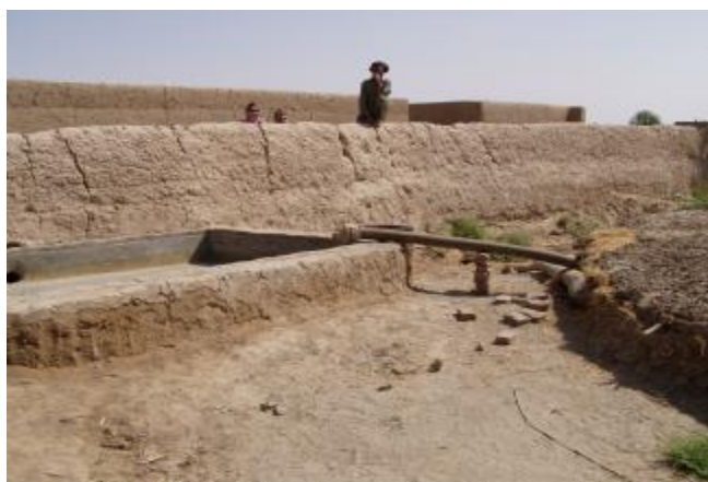
Fig. 16 & 17. Construction and distribution of surface pipes through which underground water is directed to cropping fields

this type of water reserves could be an additional source for land reclamation and agricultural development of plain desert zones in all riparian countries.