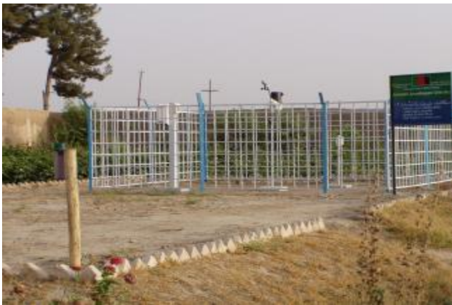
Fig.44. A meteorological station located in the territory of the Agricultural Center

Of great interest is the rehabilitation of the Afghanistan national agricultural gene banks; a facility used to safely store seeds and other phytogenetic resources that were destroyed during the civil war.