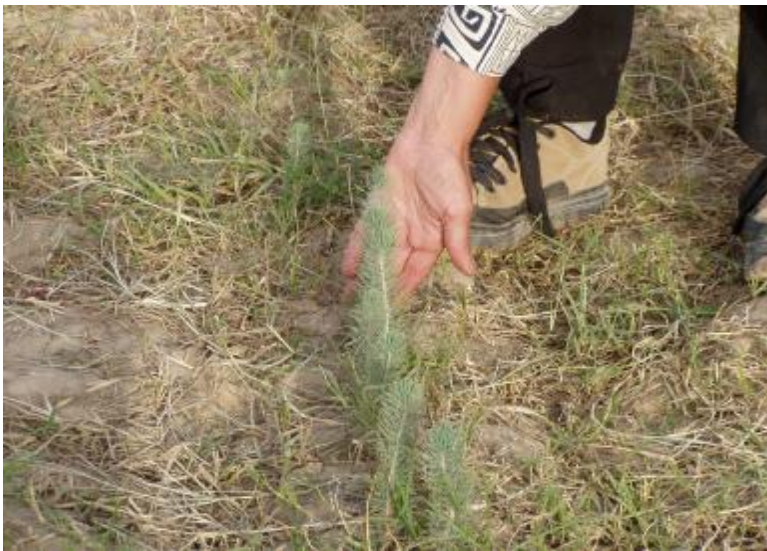
Fig. 47. Seedlings of coniferous at the growing stage (Kunduz city)

Besides, the ICARDA offices in Afghanistan as the one in Kunduz (Fig. 48) provide farmers with vaccines to prevent diseases in Afghan livestock, as well as land in water management.