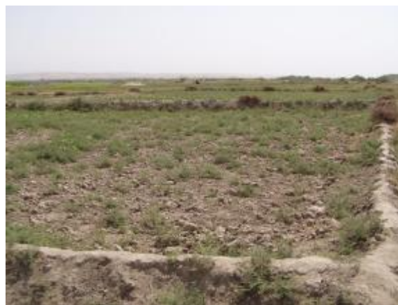
Fig. 5. The main water canal in Korakuturma (partially destroyed)

It was further distributed through the left and dextral networks of shallow ground canals that can still be differentiated (Fig.6, 7).