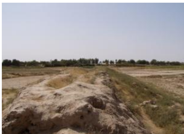
Fig. 4. Remains of pumping (small water pools in Pyandzh' floodplain)

does not exceed 6-7m. Some water could get through the two failing canals from the riverbank, where water used to flow (the result of natural sedimentation). The irrigation of 4-5 thousand ha of virgin lands was accomplished in this way. As can be seen in Fig. 5, water in the vicinity of Qarakutermah site used to flow from the main canal with a length of 400 m.