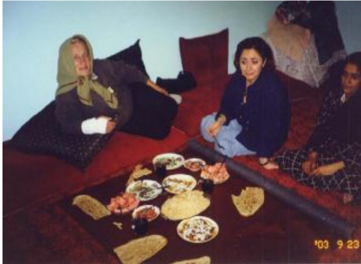
Fig. 53. Discussing the social changes with Afghani women