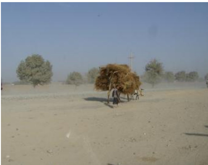
Fig. 23. Fuel wood and herbs collection by local people on Shirmohi desert

During an interview with the local people it was learned that the worst nightmare of Afghans working on their fields or taking their livestock to pastures is the risk of landmines. The presence of a large number of landmines makes Afghanistan the world's most deadly minefield. According to a survey on 37 communities of Afghan people in 1994 that was conducted by CIET International, landmines had affected the lives of 12% of all households (Anderson et al., 1995).