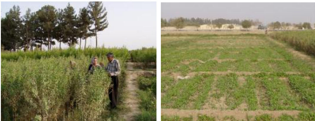
Fig. 45, 46. The experimental station for seedlings and legumes development for framers needs

There is also an urgent need to focus not only on the long-term rebuilding process, but also on the near-term requirements of farmers for basic food consumption and nutrition. For such purpose there is a large fruit trees and pistachios seedling nursery in the center of Kunduz managed by the local scientists and farmers under the financial support of International Agricultural Developments Agencies; as seen in Fig. 45, 46.