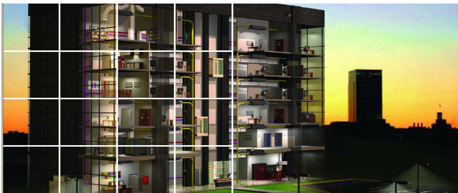
FIGURE 4. AUTOMATED SYSTEMS IN BUILDINGS, ENVIRONMENTAL TECHNOLOGIES TO CONSTRUCT EDIFICES

E. Construction and building; it is the entry with the heaviest impact on the cities; therefore the following technologies that may help us control the impact of these activities are proposed.