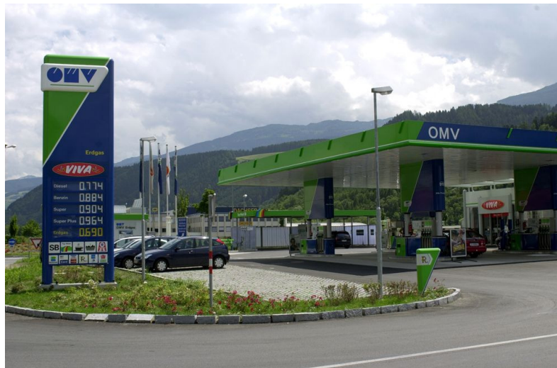
FIGURE 2. STATION OF NATURAL GAS FOR URBAN SUSTAINABLE TRANSPORT (SOURCE:

HTTP://EN.CNGV.GOV.CN/UPLOADFILES/2006449309507.JPG ).