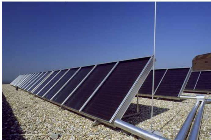
FIGURE 6. ARRANGEMENT OF PHOTOVOLTAIC PANELS FOR ALTERNATIVE ENERGY GENERATION IN BUILDINGS

J. New construction materials applied to sustainable development; the new materials either ceramic, metallic, polymeric, natural or compound (combination of the previous) are of great help in the application of new environmental technologies in the development of the cities. The new construction materials preferably must be: recyclable, reusable, biodegradable, re-producible and long-lasting. An instance of materials of great usefulness for the environment and improvement of conditions of the cities and urban spaces is pervious or porous concrete, which is not new, however has recently experienced a great boom in use in order to allow the reload of the aquifers, decreasing the effects of the urban heat islands, and indeed provide the cities with greater volumes of water. This material is basically a cement compound with coarse aggregates and without fine aggregates, adding to the mixture a superplasticizer to increase the mechanical resistance of the material (Wang, 1997) and that additionally preserves its capacity of permeability of water to the subsoil.