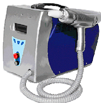
FIGURE 5. PORTABLE LASER CLEANER TO BE USED IN THE PRESERVATION AND REHABILITATION OF MONUMENTS AND WORKS OF ART

F1. Digital photogrammetry; it helps take measures to feed the urban information systems in a city.