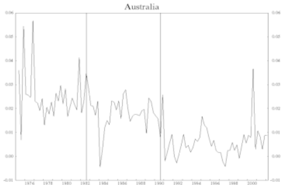
Figure C1: Identified Structural Breaks in the CPI Inflation Series, by Country