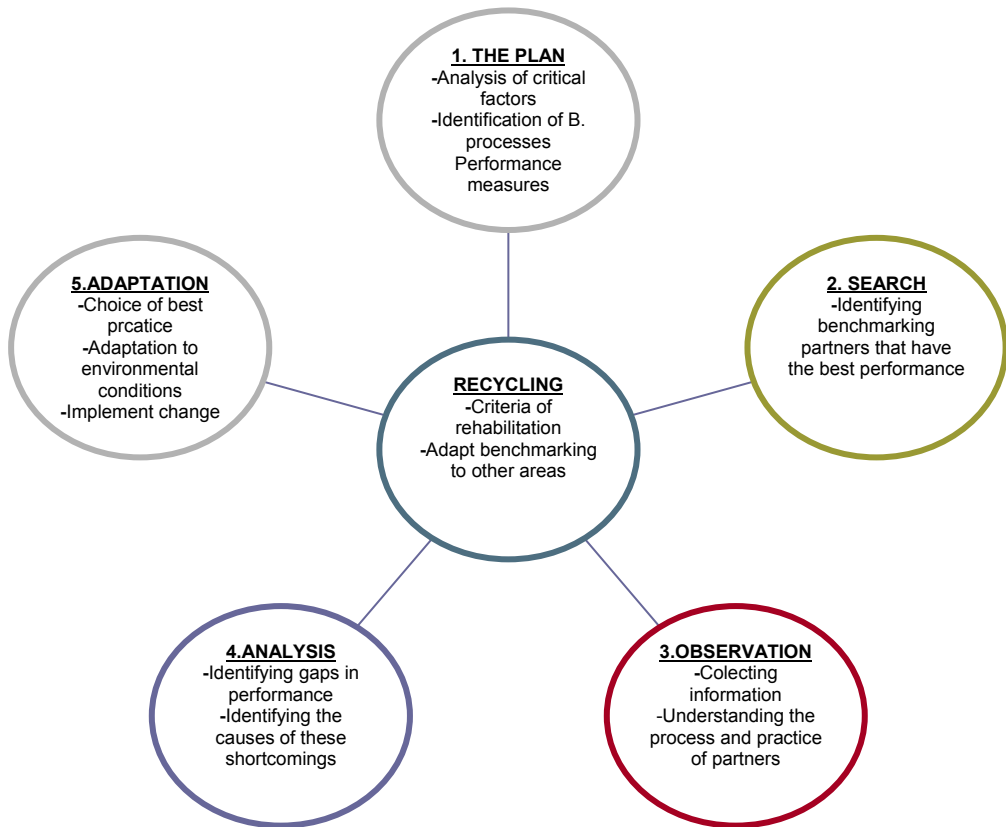
Figure 3. The Wheel of benchmarking process

process as “the wheel of process(Andersen, B. and Pettersen, P-G, 1996). benchmarking”, indicating that benchmarking is a continuous