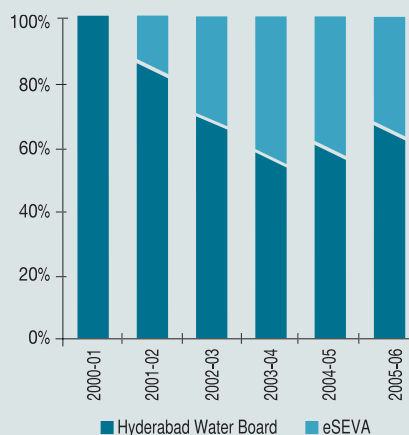
Proportion of Total Collections: Hyderabad Water Board and eSEVA