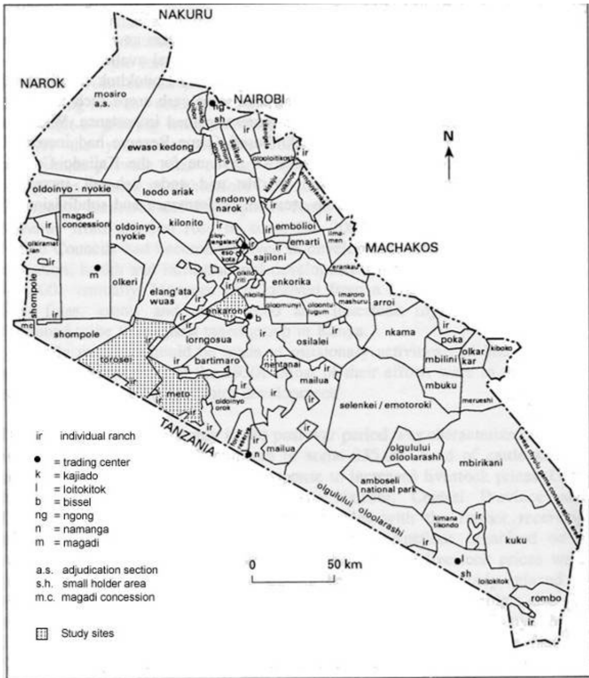
Figure 2-- Location of study sites: Enkaroni, Meto, Nentanai, Torosei