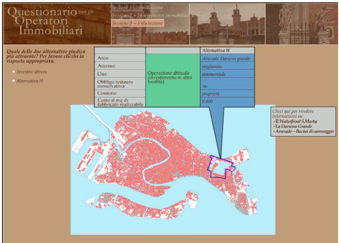
Figure A.2: Example of Choice between a Venice and a non-Venice alternative