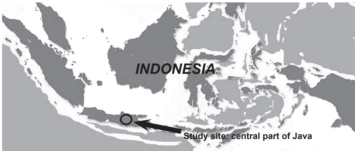
Figure 1. Location of study

available. Figure 1 shows the location of the study site.