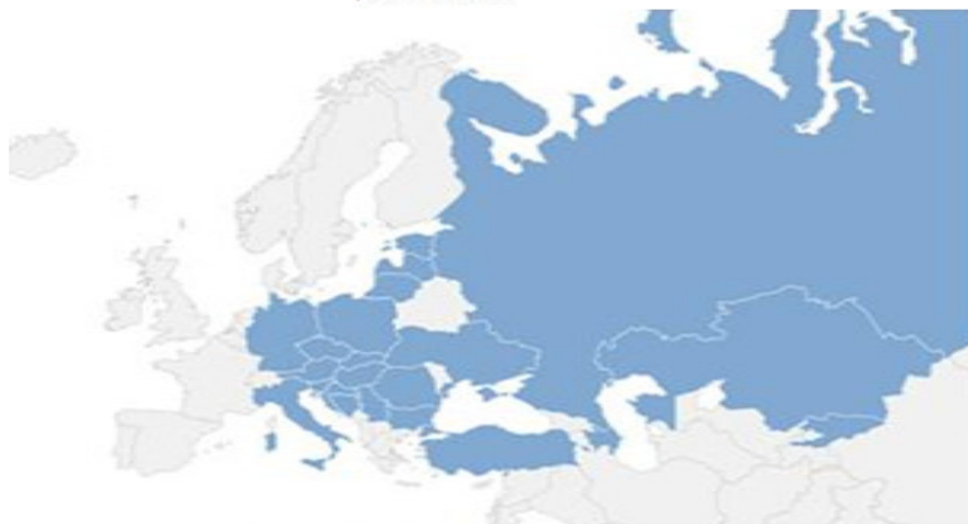
b) GRUPUL UNICREDIT

Figure 2. a) core banking systems at Erste Bank Group (Source: (Erstegroup, nd))