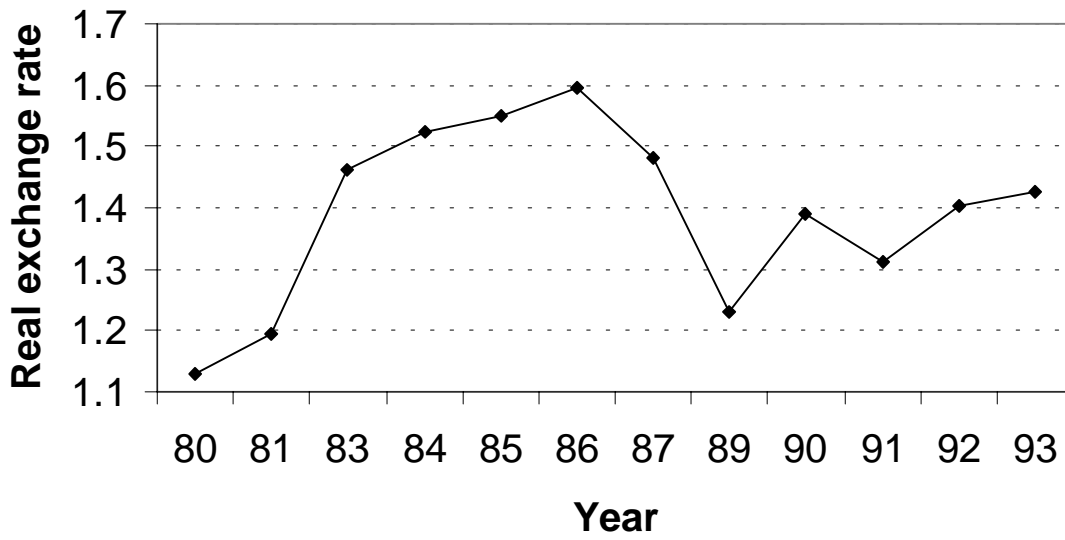
Figure 4: Electrical Machinery, SIC 36