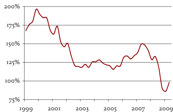
FIGURE I. NOMINAL FUNDING RATIO OF A TYPICAL DUTCH PENSION PLAN, Q1 1999-Q2 2009