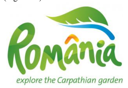
Figure 10 The logo for Romania's tourism brand

The official launch of Romania's tourism brand was held on 29 July 2010 at the World Exhibition in Shanghai. It was accompanied by the slogan "Explore the Carpathian garden" (Figure 10).