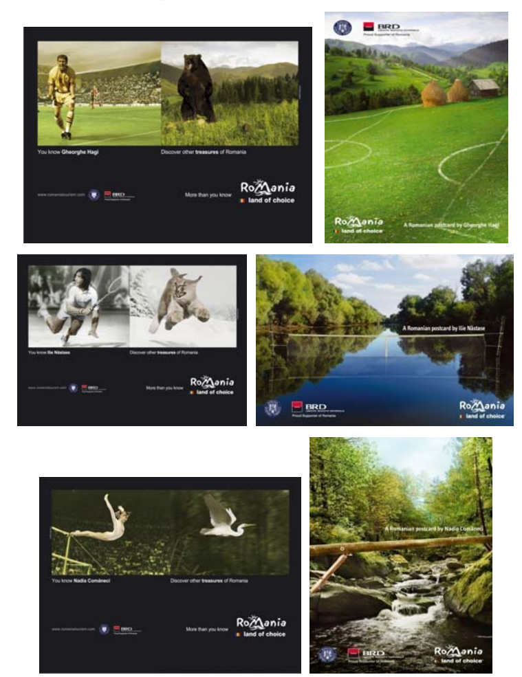
Figure 9 "Romania - Land of choice"

Short time after the campaign was launched MT was involved in a scandal related to the slogan, because it was already registered at the State Office for Inventions and Brands by a private individual.