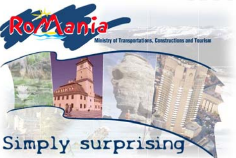
Figure 3 The campaign "Romania – simply surprising"

The campaign to promote the country's tourism image Romania , always surprising meant to create a website (www.romaniatravel.com) (Figure 3) and several promoting spots. The campaign was created by advertising agency Ogilvy&Mather Advertising and cost $ 1,7 million. Launched in 2004, the campaign had as main objectives: changing perceptions and attitudes towards Romania, especially in EU countries and USA and presenting Romania as an attractive tourist destination. The message was that Romania has changed in terms of tourism. The campaign addressed to potential tourists aged between 20 and 55 years, with average income, informed, attracted experiences, interested in culture and history. The campaign was conducted from June to August and consisted of one daily spot Romania , always surprising on the TV channels: Euronews, Eurosport, Discovery, CNN, BBC.