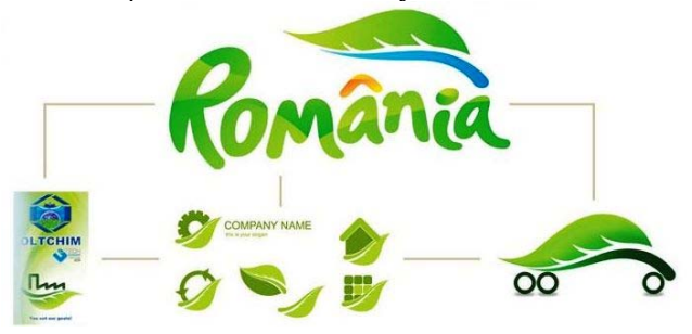
Figure 11 Romania's logo, Oltchim's imprint, the set sold on shutterstock.com and the logo of the transport company "Change Transport"

1) The logo resembles strikingly an Irish project regarding eco-transport, as well as a poster used by Oltchim at an exhibition in 2009, and it can be bought from an image bank with approximately 250 Euros (Figure 11). Because of this one cannot speak about uniqueness and authenticity.