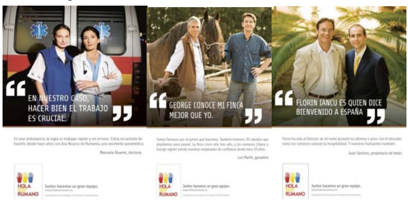
Figure 7 Hello, soy rumeno campaign

• Spain: "Hola, soy rumeno" (Hello, I am Romanian!) (Figure 7). The campaign was successfully implemented by Saatchi&Saatchi Spain at a budget of 3,5 million Euros.