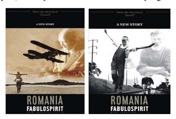
Figure 4 Prints for the campaign "Romania – Fabulospirit"

Fabulospirit was based on communicating the success stories of Romania. with known or still unknown elements that would draw attention on the creative and innovative spirit, with mythical allusions to the country's genesis.