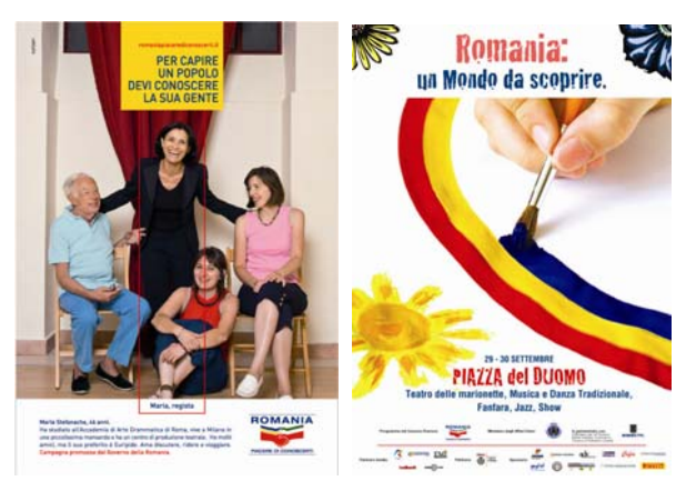
Figure 8 The campaign "Romania. Piacere di conscerti"

• Italy: "Romania. Piacere di conscerti" (Romania, pleased to meet you!) (Figure 8). The campaign was implemented by the Playteam Italian agency at a cost of 4,2 million Euros.